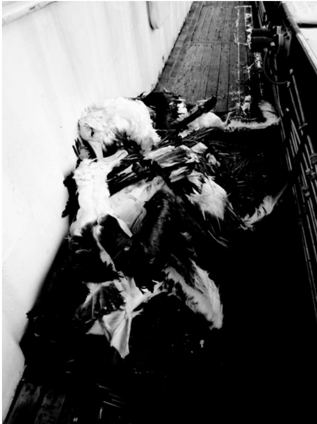
Fig. 5. Black browed albatross killed in an Antarctic longline fishery.

( Gobionotothen gibberifrons (Lönnerberg)), the Scotia Sea icefish ( Chaenocephalus aceratus (Lönnerberg)) and the South Georgia icefish ( Pseudochaenichthys georgianus Norman; Gon & Heemstra 1990, Kock 1992).