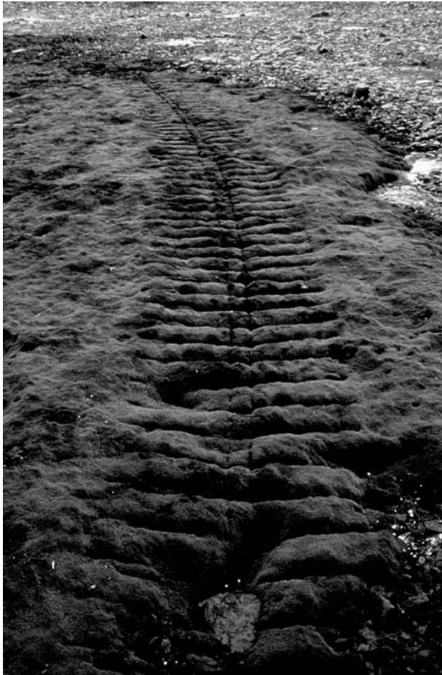
Fig. 2. Bulldozer tracks over a moss patch on Fildes Peninsula.

(Poland et al. 2003). It is our opinion that this is likely to reflect a historical lack of coordinated scientific study rather than a lack of disturbance per se . It has been stated that direct impacts on Antarctic terrestrial ecosystems are relatively minor (Huiskes et al. 2006); however, such simple statements can lead to possible misconception. It is true in an absolute sense that, by metrics such as the area of ground affected or the number of humans involved (direct “footfalls”), impacts can be described as restricted. On the other hand, only about 0.34% of the Antarctic continental area is ice free, and it is here that most research stations are built. Human activities inevitably compete with terrestrial ecosystems, as well as seals and seabirds, for the small areas of ice free ground available, intensifying the pressure on individual sites at a local scale.