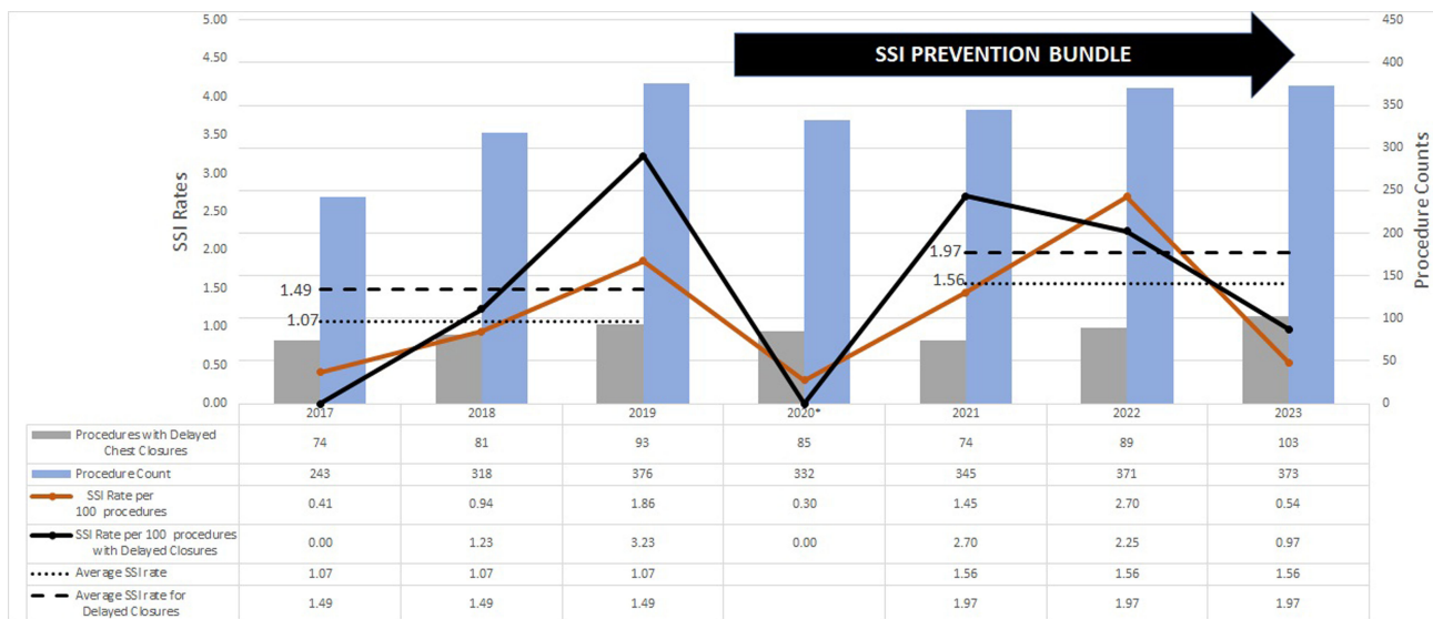
Figure 1 Summary of Pediatric Cardiothoracic Procedure Counts and Surgical Site Infection (SSI) rates from 2017 – 2023 in a Single Pediatric Center. *Year 2020 rates were excluded from comparative analyses to account for bundle implementation