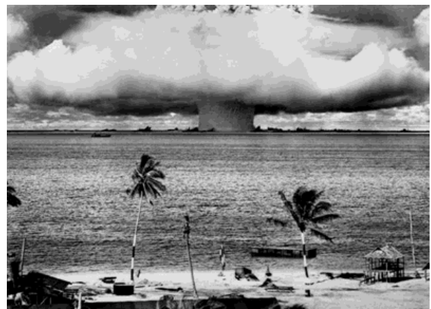
“Bravo Shot” H-bomb test, Bikini, March 1, 1954

The March, 1954 “Bravo Shot” H-bomb test in the Pacific dumped radioactive debris on the Marshall Islands, U.S. servicemen, and the crew of a Japanese fishing boat. The multi-megaton blast infected Marshall Islanders with radiation sickness and caused cancers in the years that followed. Their contaminated home on Bikini Atoll remains uninhabitable to this day. U.S. servicemen who had been purposely transported by the Navy into the blast zone have suffered from multiple cancers from radiation exposure. For years their claims denied were denied by the Veterans Administration. It took an act of Congress in 1990 to provide compensation for them and their children with birth defects. The crew of the Japanese fishing boat, Lucky Dragon No. 5, suffered from acute radiation poisoning. One crew member, Kuboyama Aikichi (age 40), died while in treatment for exposure.