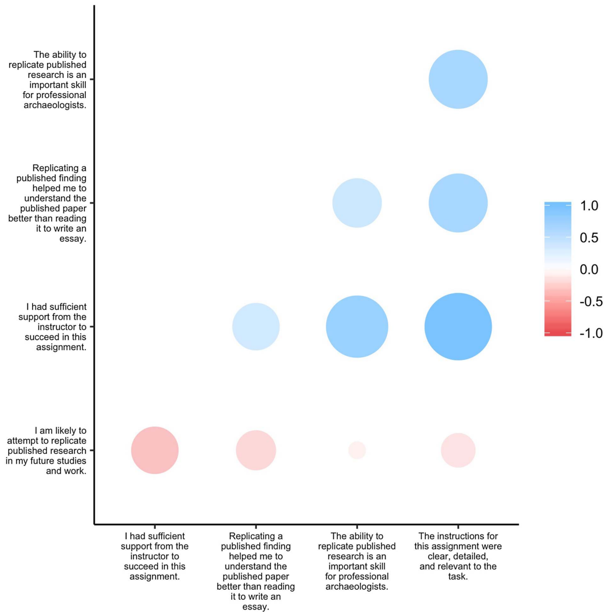
FIGURE 2. Correlations among feedback items with Likert scale responses. The size of the dot indicates the magnitude of the correlation, and the color indicates the direction (red is negative, blue is positive). Correlations were computed using Spearman’s (1904) method.

detailed rubric, and the instructor meeting with each group to discuss their work and answering students’ questions promptly on Slack. The strongest negative correlation is between the statements about instructor support and doing replication in future work. This might suggest that the students received so much support that they did not feel capable of doing a replication like this by themselves. We see confirmation of this in the free-form comments, such as “it would not have been possible for us to do this correctly on our own.” These correlations indicate a need to equip students with skills to work more independently of the instructor and to strengthen students’ self-efficacy with replication skills.