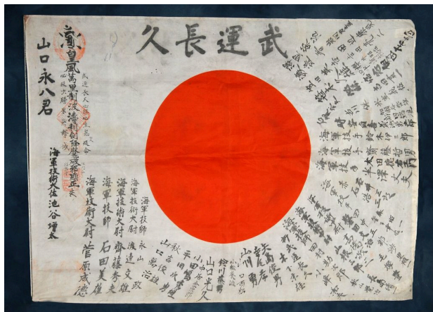
Signed Hinomaru flag of Eihachi Yamaguchi.

満月や水兵永く立泳 Mangetsu ya suihei nagaku tachioyogi A full moon tonight— sailors tread water for long, waiting and waiting. Note: The poem suggests sailors after their ship was sunk.