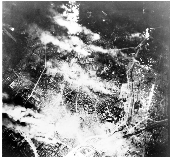
Tokyo Firebombing, May 26, 1945.

Takahashi Mutsuo, the distinguished free-verse poet who also won major prizes in traditional tanka (short poems usually of five unrhymed lines of 5-7-5-7-7 syllables) and haiku, characterized Mitsuhashi’s work as “pure haiku”—results of an attempt to figure out what might be accomplished within the confines of 5-7-5 syllables. The poems included here date from the 1930s through 1993.