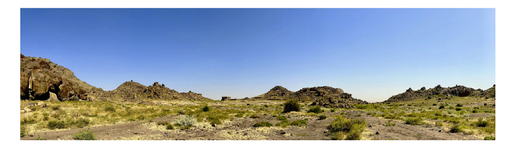
Figure 3. The archaeological site of Jebel Moya, right above the village.