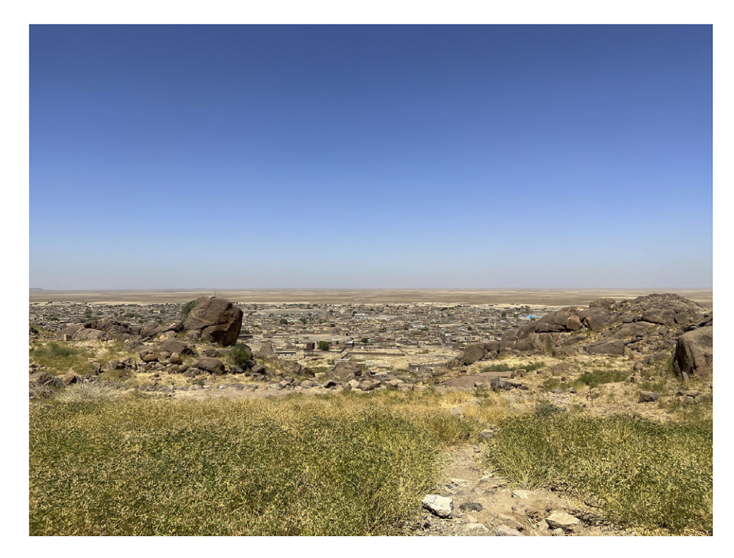
Figure 2. The village of Jebel Moya as seen from the top of the mountain.