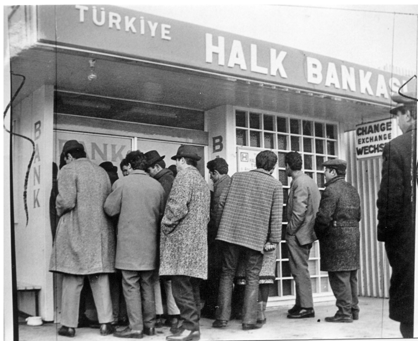
FIGURE 3.2 Guest workers send remittances at Türkiye Halk Bankası, one of the many Turkish banks with branches in West Germany, ca. 1970.

the Euromarket rate. Sweetening the deal, the publicly owned Turkish Republican Central Bank guaranteed the principal and interest against the risk of a potential lira devaluation. The Turkish government, too, benefitted from the CTLDs, which constituted short-term loans in Deutschmarks. In terms of process, the commercial banks transferred guest workers' deposited Deutschmarks directly to the Turkish Central Bank, which returned the adjusted sum in lira and further loaned the Deutschmarks to state-owned enterprises for the financing of imports, long-term investment projects, and the repayment of foreign debt. In 1975, luxuriating in the massive influx of foreign currency, the Turkish government extended the opportunity to hold CTLDs to all nonresidents, including foreign corporations. 71