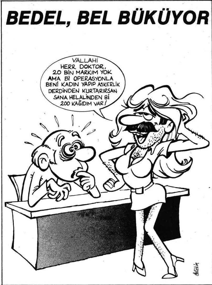
FIGURE 3.5 FEBAG activists published a humorous cartoon in their newsletter, conveying the desperation that young migrants felt when trying to pay their way out of military service, 1984. The caption reads: “By God, Herr Doctor, I don’t have 20,000 marks, but I do have 200 bucks for you if you’ll do an operation to make me a woman and save me from military service.”