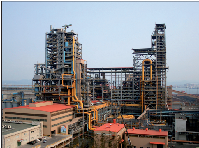
View of existing Finex 1.5 M plant, Pohang, Korea (left: melter gasifier tower, right: fluidized bed reactor tower).

plant. This ironmaking facility, which will be built at Posco's Pohang steelworks, will produce some 2 million tons of hot metal on the basis of directly charged low-cost iron ore fines and predominantly noncoking coal. The order value for Siemens is a medium two-digit-million euro figure. Upon completion of the new Finex plant scheduled for mid-2013, a total of approximately 4 million tons of hot metal will be produced per year using the Finex process at Posco.