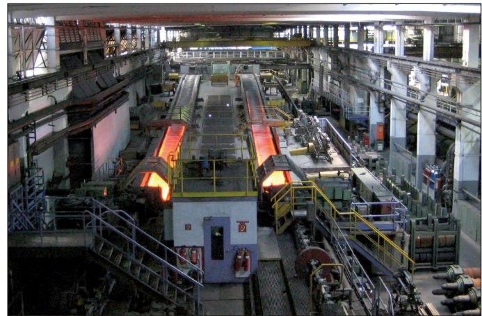
Wire rod mill of Badische Stahlwerke GmbH (BSW) in Kehl, Germany. The mill will be thoroughly modernized by Siemens.

Siemens VAI's upgrade of the Badische Stahlwerke wire rod mill, which mainly produces base material for concrete reinforcing bar, will result in an increase in production capacity and a broader spectrum of qualities and sizes due to increased automation and the possibility of thermomechanical rolling.