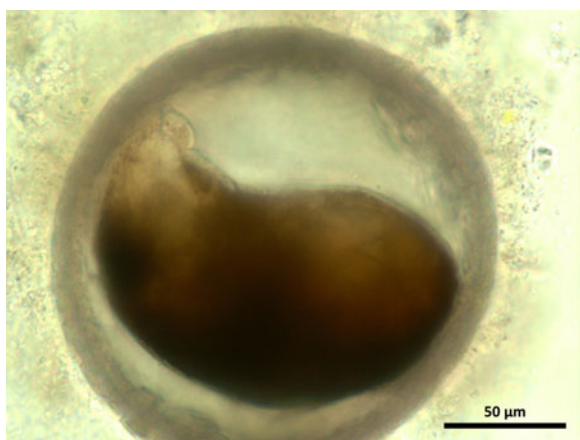
Fig. 3. Activated Calicophoron daubneyi metacercaria (pre-excystment).

(2010) to obtain the maximum number of F. gigantica NEJs. Although shorter incubation times have been reported to achieve excystment in other trematode species, the success of the overnight incubation period, with no impact on the motility of the NEJs recovered after this time, makes this an efficient and convenient protocol for excystment of C. daubneyi metacercariae in vitro . It has recently been shown that F. hepatica NEJs can be excysted and maintained in vitro for long-term studies of their growth and development (McCusker et al. 2016). Our development of a successful method for in vitro excystment of C. daubneyi metacercariae now allows similar refinement of culture conditions that permit long-term studies of rumen fluke.