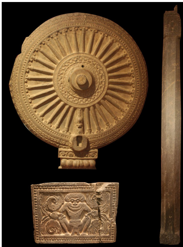
Figure 4. Three sections of a Dvāravatī dharmacakra : Clockwise from bottom left, the socle, the cakra , the stambha (these three objects are from separate dharmacakra and were not found as a set)

primarily in Dvāravatī art and then continues to be employed in some examples of Lopburi period art.