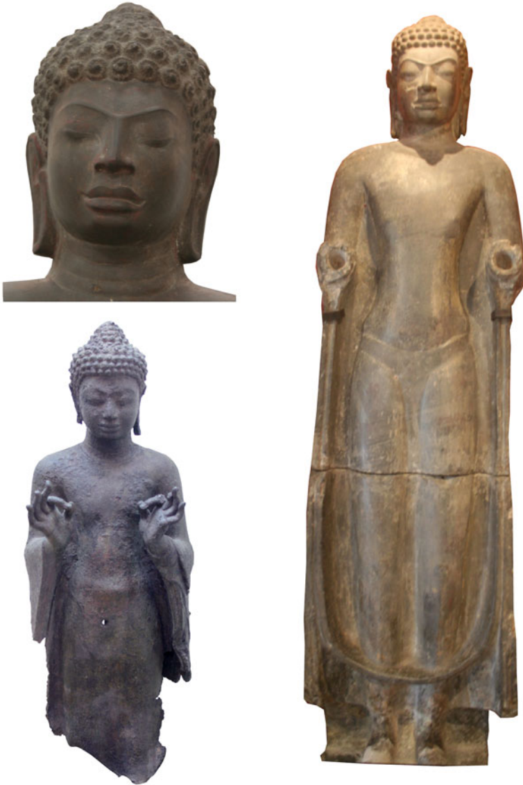
Figure 3. Three examples of Dvaravati sculpture. Clockwise from bottom left: bronze Buddha from U Thong National Museum with hands in the double vitarka mudra gesture; Detail of a Buddha image from the National Museum Bangkok showing the characteristic facial features such as the broad face with thick lips and thick heavy hair curls; Buddha from the Phra Pathom Chedi National Museum showing the classic Dvaravati U-shaped robe