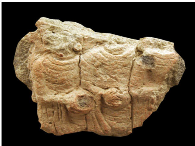
Figure 6. Fragmentary terracotta relief moulding of three Buddhist monks with alms bowls, today housed in the U Thong National Museum

three Buddha images are indicative of this. 94 Of most significance to this discussion are the results of eight AMS radiocarbon dates obtained from controlled excavations which Gallon undertook in 2009 and 2010. 95 They indicate that the site was occupied from the early fifth century and declined a few centuries later. The most intensive phase of occupation was from the fifth–sixth centuries to the mid-seventh century, with the site being abandoned by the ninth century. 96