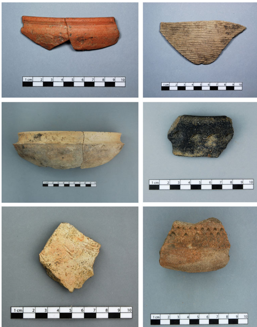
Figure 2. Common diagnostic Dvaravati pottery types excavated at Kamphaeng Saen. Clockwise from bottom left; sherd with line and wave designs; fragment of carinated vessel found in context dating to the 5th–7th century; fragment of a relatively high-fired matte-surfaced semi-fineware bowl found in context dating to the 5th–6th century; cord-marked sherd typical of Dvaravati pottery but also found throughout Southeast Asia during this period; finger/fingernail-impressed sherd; sherd with ‘hanging triangles’ design