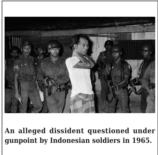
An alleged dissident questioned under gunpoint by Indonesian soldiers in 1965.