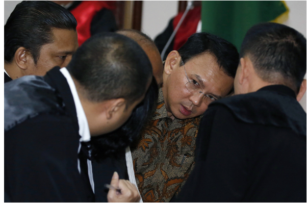
Jakarta's Gov. Ahok speaks to his lawyers inside the courtroom during his blasphemy trial at the auditorium of the Agriculture Ministry in Jakarta on April 11, 2017.

Freeport Indonesia did not respond to requests for comment.