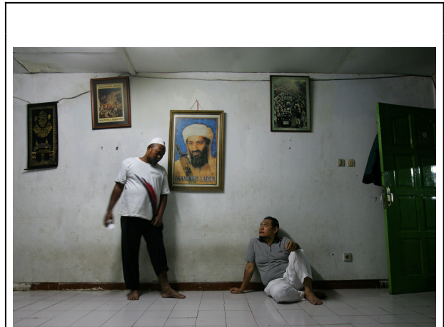
Islamic Defense Front headquarters in Jakarta, where a portrait of Osama bin Laden hangs on the wall in 2007.

The NSA had no comment on the content of the intercepts. The White House did not respond to requests for comment.