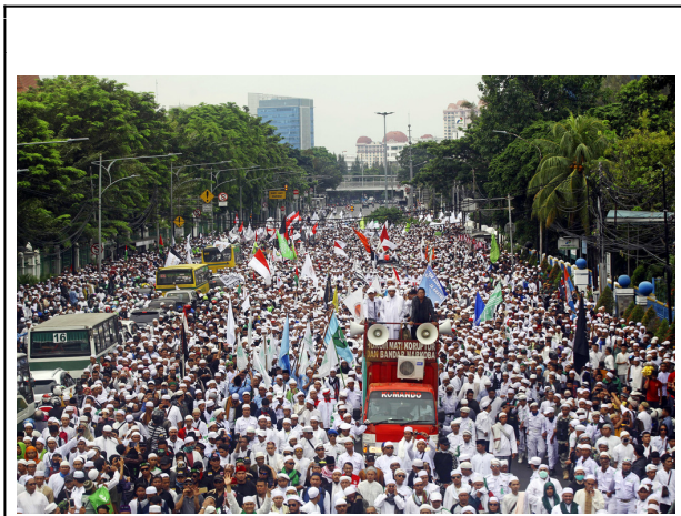
Thousands of members of the hard-line Islamic Defenders Front take part in a protest in Jakarta, Indonesia, on Oct. 14, 2016, to show their disapproval of Gov. Basuki Tjahaja Purnama, better known as Ahok, who has been charged with anti-Islamic blasphemy.