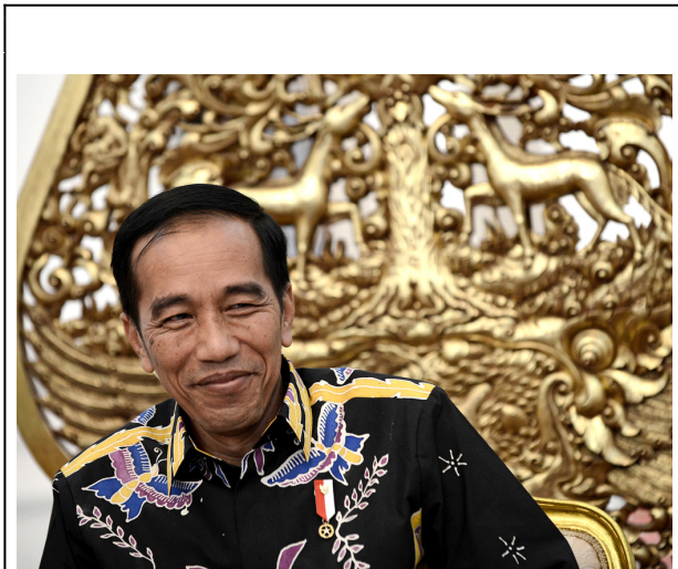
Indonesian President Joko Widodo at the Merdeka Palace in Jakarta on March 27, 2017.

Islam). Originally established by the security forces — the aparatus — in 1998 as an Islamist front group to assault dissidents, the FPI has been implicated in violent extortion, especially of bars and sex clubs, as well as murders and attacks on mosques and churches. During the mass protests against the governor, FPI leader Habib Rizieq Shihab has openly called for Ahok to be “hanged” and “butchered.”