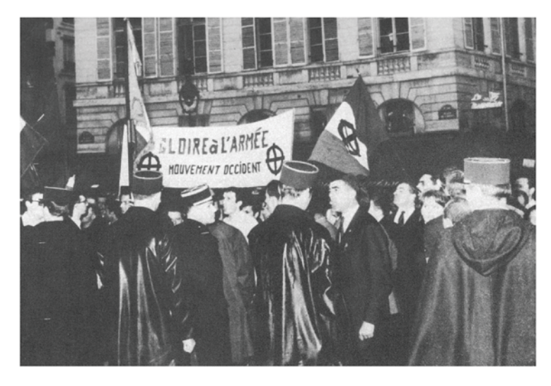
Figure 2. Protest at the Odéon in response to Roger Blin's production of Genet's Les Paravents. (From La bataille des Paravents: Théâtre de l'Odéon 1966, edited by Lynda Bellity Peskine et Albert Dichy)

The Screens opened on 6 April 1966 to an audience sharply divided between the Leftist supporters of the play and its opponents on the Right.2 On 30 April, a group of over 30 veterans form colonial military forces and militants from the right-wing movement, Occident, interrupted the performance by throwing smoke bombs and glass bottles onstage, and then attacked the cast, who fought back with chairs and other props (Lavery 2013:169). On 7 May, the Occident group tried to set