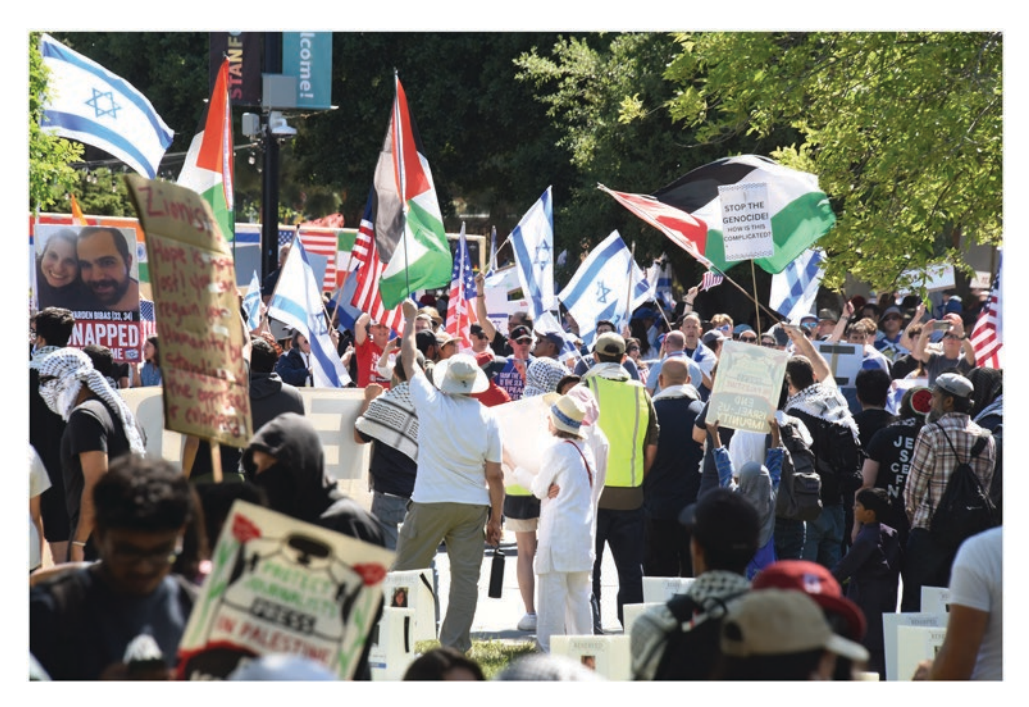
Figure 4: Battle of the flags. Stanford University, 14 May 2024.

the more zealous among them let that awareness slip into the open. The main ideological takeaway of the Gaza assault is the same as the ideological message that crystalized during the long backlash to the summer of 2020 in the US: in order to remain in power, a hegemonic formation—be it class, ethnic group, or caste—first needs to learn how to tolerate its own cruelty. Their words and actions are stating their credo loud and clear: my lifestyle is more important than your life .