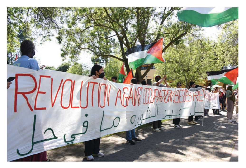
Figure 3: Stanford People's University stands strong against "interfascist forces." Stanford University, 14 May 2024.

The "battle of The Screens ," as the events surrounding the French premiere of the play came to be referred to, took place close to the end of the process of decolonization, which opened the way to the equally brutal process of recolonization. Today, Genet's play can serve as a reflective surface that captures similarities between colonized Algiers and Palestine: an Arab land captured and absorbed by a foreign power (unlike other French colonies, Algiers was administratively a district of France), decades of domination, racism, and apartheid supported by massive military and police force. And it goes from there. This process becomes visible at certain points of inflection in different parts of the world, often marked by separations and cruelties reminiscent of Genet's play. The Separation Barrier in the West Bank, the wall along the US southern border, and the charred bodies of Blackwater "contractors" suspended from the bridge in Fallujah, Iraq: while these sites are scattered across the world, the imagery is strikingly reminiscent of The Screens . The breakdown of partitions surrounding the Gaza camp made many jump from their lawn chairs.