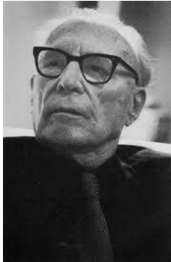
Karl August Wittfogel

Schwartz's challenge to a generic "totalitarian model," applicable to Communist and fascist regimes alike, elicited dissent from its defenders. 10 The most acerbic was a series of diatribes penned by Karl August Wittfogel, a former German Communist who had fled Hitler's Third Reich to become a vocal critic of Communism in both the Soviet Union and China. A professor of Chinese history at the University of Washington, Wittfogel had gained notoriety in the field by accusing fellow Sinologist Owen Lattimore of Communist sympathies at the McCarran hearings on the "loss" of China. 11 In Wittfogel's view, Chinese Communism was a carbon copy of Russian Communism. He rejected the notion that Mao Zedong had been an innovator in any sense of the word; every strategic move and ideological justification that marked the Chinese revolutionary experience, he insisted, could already be found full-blown in Leninism. For Wittfogel, Chinese Communist doctrine did "not exhibit any originality, 'Maoist' or otherwise." 12