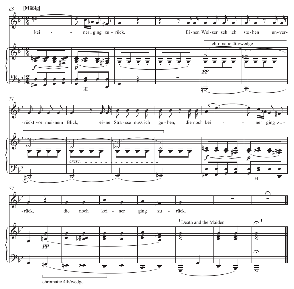
Example 10.4 "Der Wegweiser," mm. 65-83

Linked to antique style is the religioso topic present from the start of the cycle with the turn to F major (and its subdominant Bb) in verse 1 of "Gute Nacht." The hymn-like veneer added to a variant of the trudging motif in the accompaniment there comes to the surface (like much else) towards the end of the cycle. Graham Johnson sees the key of F major, inflected with subdominant color, that Schubert chose for "Das Wirtshaus" as an anomaly, illogically poised between the G minor songs on either side. <sup>28</sup> But we could interpret it as a reference to the original manifestation of that topic in "Gute Nacht," in those same keys (F and Bb). Seen in this light, in "Das Wirtshaus," they serve simultaneously as a reminder of the hope of lasting love that was lost at the origin of the journey, and a signal of the hope for death that has replaced it.