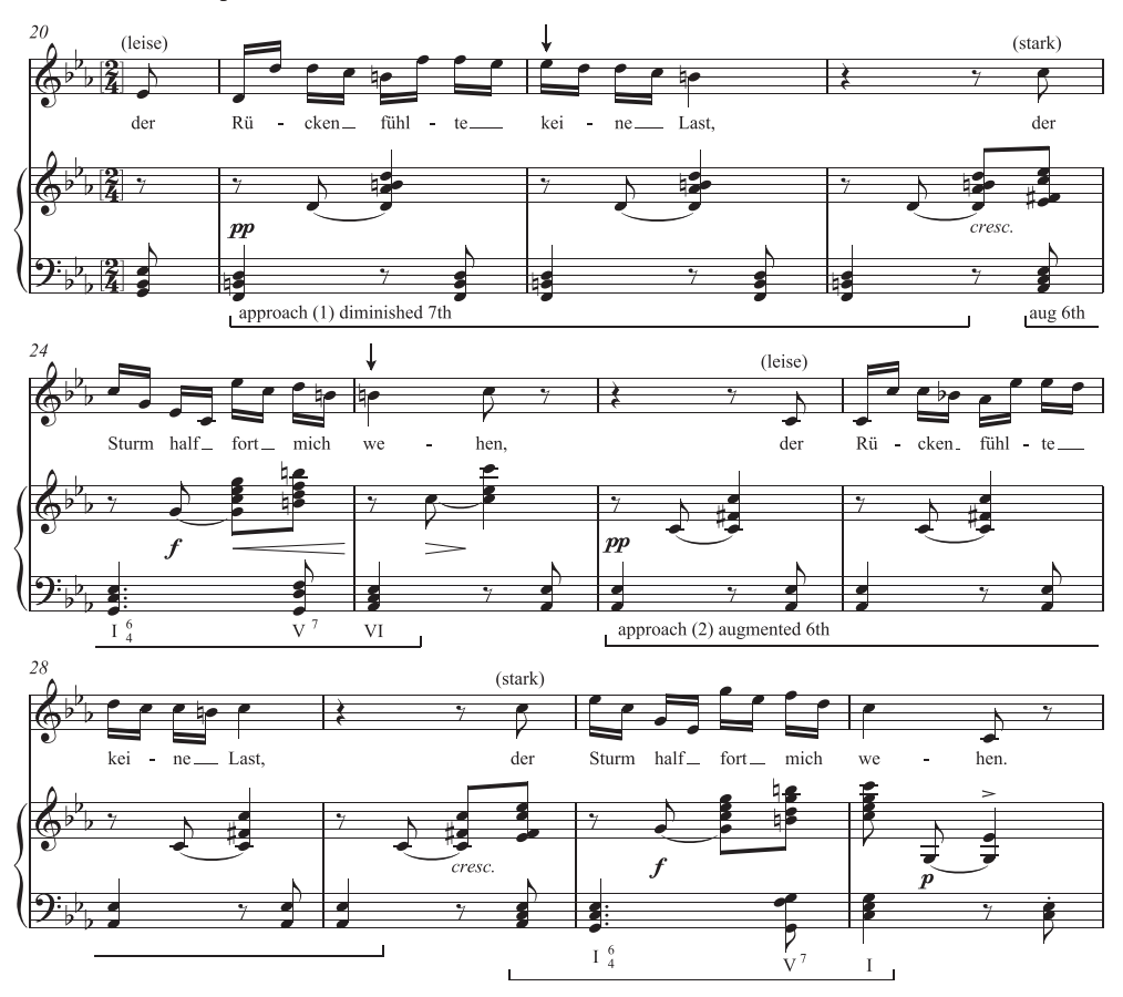
Example 10.2 "Rast," mm. 20-31

these proceedings, the vocal line soars beyond the confines of its contours earlier in the song. Schubert adds a tiny, affecting detail to the vocal part in the final version of the passage, inserting an anticipatory note at m. 55, before the upwards resolution of the appoggiatura on the word "regen" (stir).