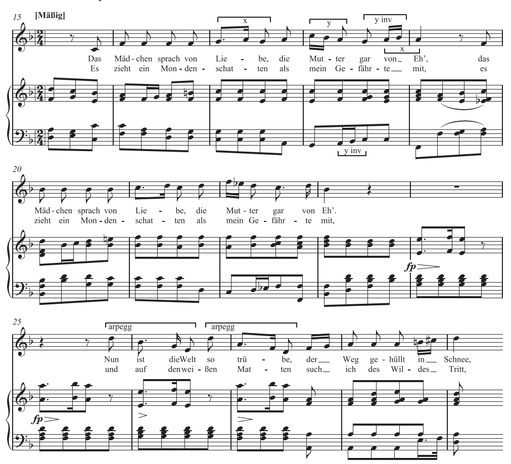
Example 10.1 "Gute Nacht," mm. 15-299

to the prolonged agony the wanderer carries with him. The extended diminished seventh chord heard at mm. 21–23 (see Example 10.2) and again at mm. 51–53, prefacing the approach to the cadence, is exploited for its disturbing properties. Its configuration, with notes crowded low in the piano accompaniment, together with the dissonant appoggiaturas in the voice (arrowed on Example 10.2), contributes to the harsh, grinding effect.