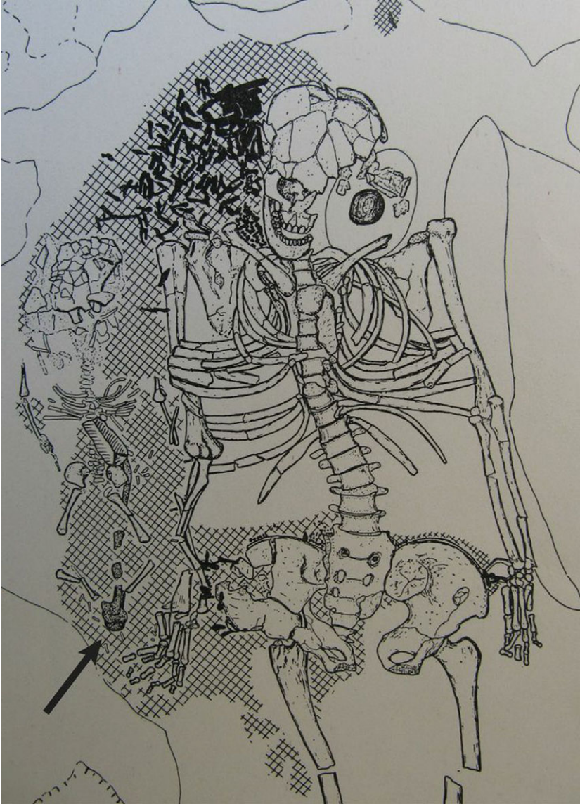
Figure 4 Original plan of Grave 8 at Vedbæk. The bulky proximal end of the carpometacarpus is indicated by the arrow in the bottom left-hand corner (Albrethsen and Brinch Petersen 1976). (Colour online)

allows for a different interpretation. The original plan of the grave (figure 4), later modified versions (e.g. Fowler 2004), and published photographs (e.g. Nilsson Stutz 2003, 233, photo 19) present the ‘wing’ remains orientated with the bulky proximal end of the carpometacarpus at the feet of the child and the distal end towards the pelvis area. Oriented in this way, however, the bulk of the wing, made up of the radius, ulna and humerus, articulating at the proximal end of the carpometacarpus, would not extend under the child,