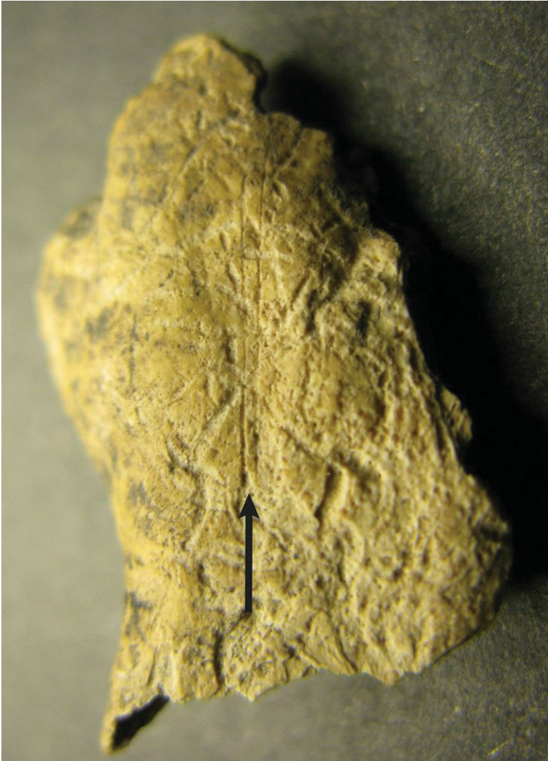
Figure 3a Close-up of a swan skull fragment from Aggersund, exhibiting two cut marks running down the length (arrowed), approx. 4 cm in length. (Colour online)

been just random sensorial reactions; these were significant as continuing engagements within the developing biography of the relationship between humans and known swans. Not only are the processes of killing and butchery distinctive, they were also, through their sights, smells, sounds and textures, and the associated affective and emotional weight, embodied and sensuous processes that produce strong mnemonic effects and would have created bodily memories (Hamilakis 2002, 124; 2010, 193). By understanding the swans as sentient social actors, the processes of killing and butchery were not