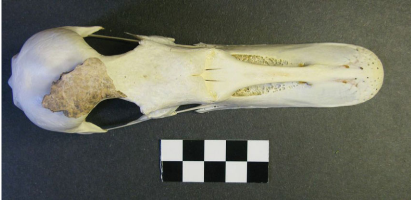
Figure 3b Location of fragment on skull. (Colour online)

a neutral necessity; instead they were powerful, emotive and distinct events, constantly mediating human relationships with swans, in turn creating strong memories that bound human understandings, the biographies of individual swans and places in the landscape to the material remains of the swans. As a result, consumption and deposition were arenas where relationships could be further negotiated.