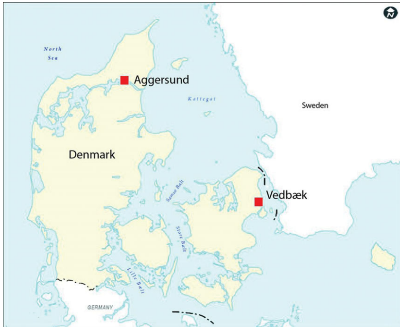
Figure 1 Map of Denmark indicating the location of sites discussed in text. (Colour online)

and was excavated in 1975, revealing an oval pit containing flint, animal bone and crushed shells (Andersen 1978, 50), dated to between 4501 and 4052 B.C., falling within the later Mesolithic Ertebølle period. Initial analysis of the faunal material by Ulrik Møhl in 1978 suggested that the site was occupied during the winter months for the specific exploitation of whooper swans ( Cygnus cygnus ) (Møhl 1978, 57). This interpretation, however, was embedded within the paradigm of subsistence and economizing, with its deeply engrained dichotomies between nature and culture, and between humans and animals. The original framework of analysis focused on the relative value and utility of the faunal remains in terms of the nutrients they provided, characterizing the site as a ‘special-purpose camp for hunting swans’ (Møhl 1978, 72–73) due, in part, to the high relative frequency of swan remains in comparison with other species recovered, thus explicitly correlating importance with calories and material yield. In the present study, we move away from an interpretation of the assemblage based on the passive conception of animals as neutral raw materials, employing instead a non-anthropocentric theoretical framework in exploring the interspecies engagements and relationships between humans and whooper swans that underpinned the treatment of swan remains at Aggersund.