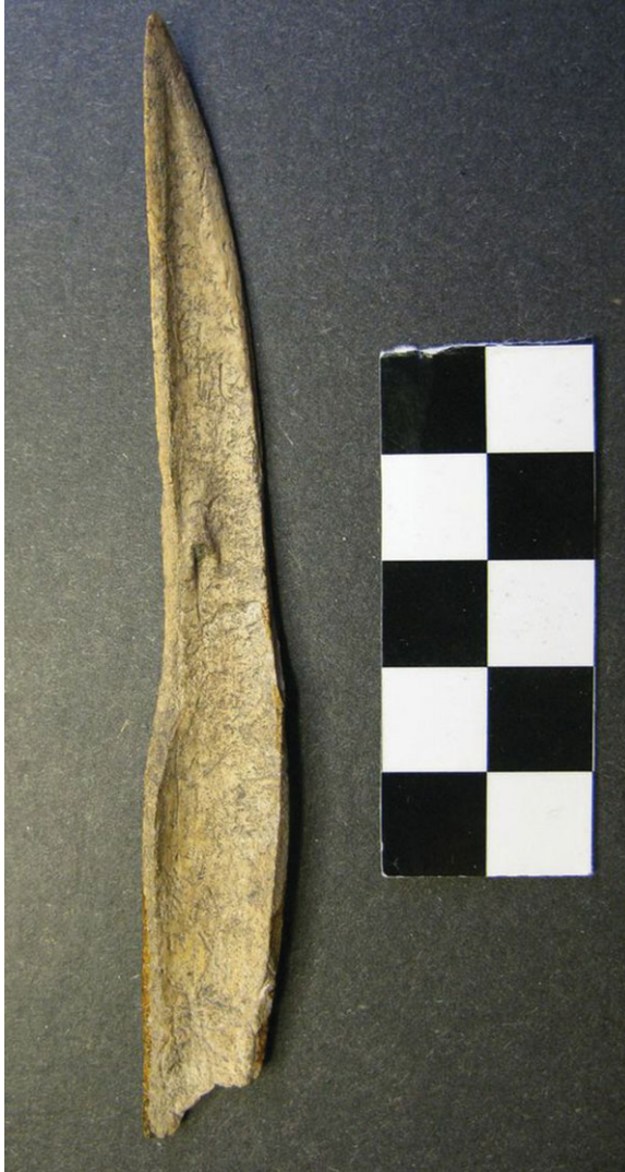
Figure 2 'Bone point' from Aggersund, made from the humerus of whooper swan, scale size 5 cm. (Colour online)

easily capable of breaking human limbs (Young 2008, 19), whilst their spiny tongue, serrated bill and strong jaw muscles (Brazil 2003, 241) are, from the authors' personal experience, formidable weapons resulting in blood being drawn and painful effects. Furthermore, when swans die, their lungs will collapse, emitting a 'feeble, flute-like and strangely melancholy' call (Wilmore 1974, 107), distinct from any other they produce. The capture and killing of a swan, understood not as a resource but as a sentient social agent, would be an emotive and theatrical event (cf. Hamilakis 2008, 10), a