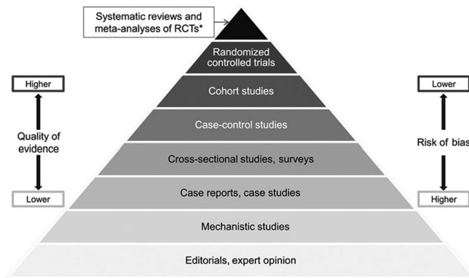
Fig. 2. Pyramid depicting hierarchy of evidence.