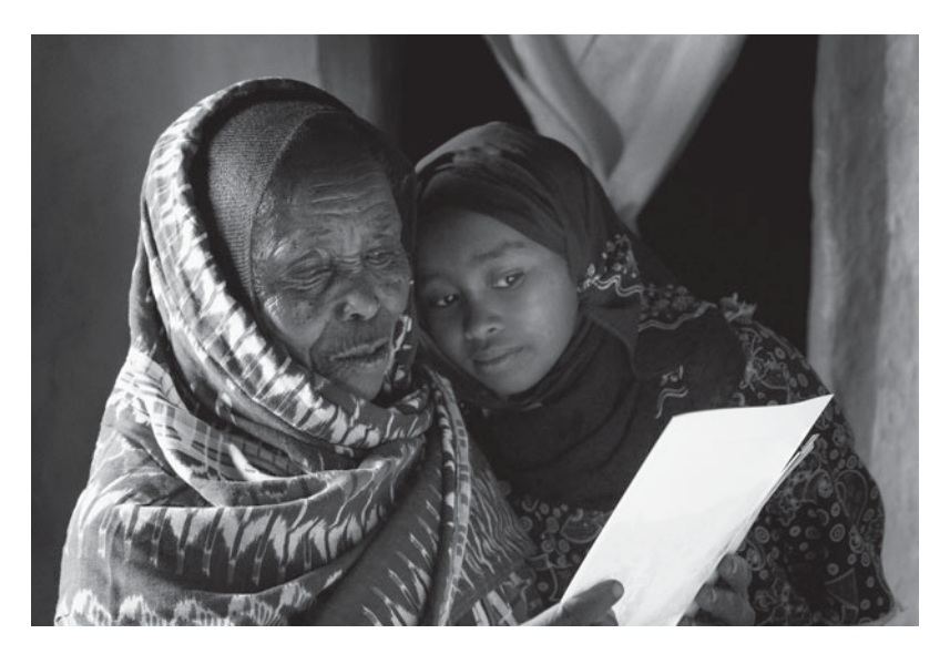
FIGURE 1 (Fig. 4.5 in the book) Bokayo and young relative looking at a photograph by Paul Baxter taken in the 1950s, Marsabit, July 2010

agency both in the process of image making and in the production of meaning. For example, Neil Carrier and Kimo Quaintance returned and discussed with relatives and descendants the photographs taken of individuals in northern Kenya during the 1950s. In this way, images originally taken to represent an 'exotic' culture were reinvested with history and biography, offering the collection another layer of meaning as well as a social after-life.