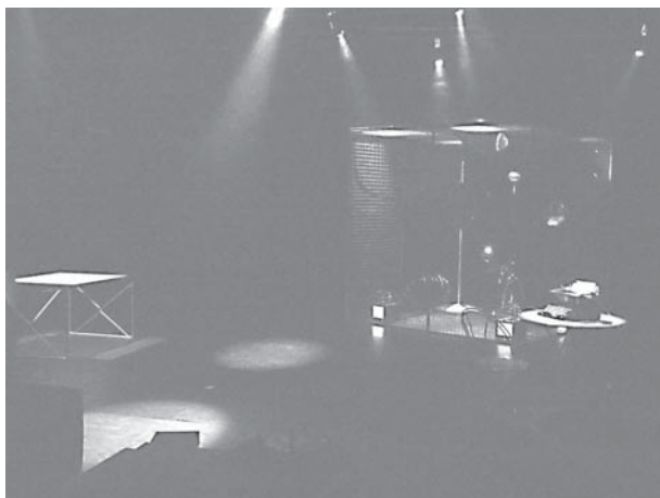
Figure 1. Spiral Fiction (April 2002).

The performance installation comprised three sets. Set one featured an eight-foot-square steel cage containing a variety of mirrors and three small video monitors (audio and video) running three structured and timed eighty-minute video compositions and three local loudspeakers. Set two featured a glass table on which