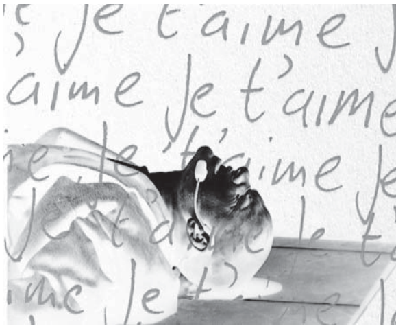
Figure 4. Still from Spiral Fiction (April 2002).

use of the sensor array, sometimes opting to make all sensors active and at other times limiting activity to the upper torso and switch hand. 4