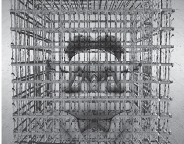
Figure 3. Still from Spiral Fiction (April 2002).

for our inquiry, and therefore are modes of Being for those particular entities which we, the inquirers, are ourselves' (Heidegger 1962: 26–7). In the fashioning of technologies, in exposing our thoughts, ideas and gestures within this landscape we become transparent; we see through and into our gestures and begin to recognise a mode of Being articulated through technology. This is what makes working with new technology interesting and of value to us as artists and enquirers after the nature of our own being. This is also why the documentation and analysis of our work and practices is important. The disclosures that analysis reveals not only tell us about the hard science of new technology but also about how we use it; it tells us about our creative choices, preferences, and modes of creative thinking.