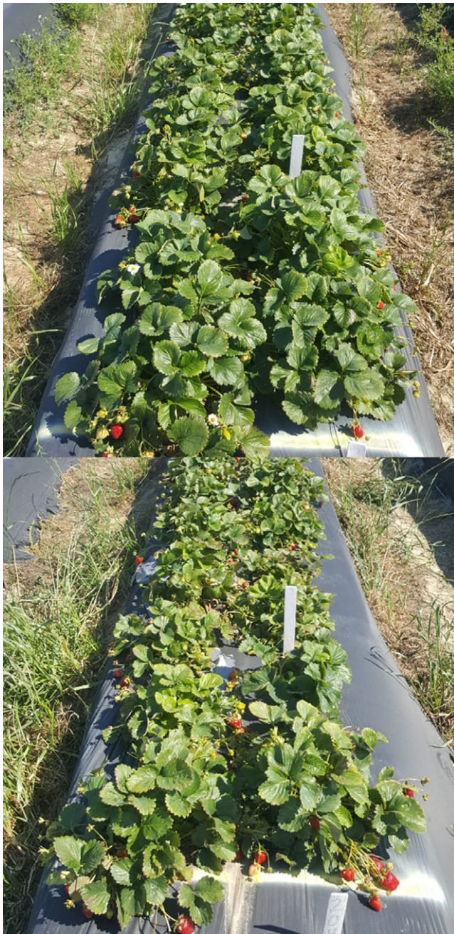
Figure 1. 2,4-D directed to row middle on both sides of polyethylene-mulched strawberry. Nontreated (left) and 2,4-D at 1.06 followed by 1.06 kg ha -1 (right) 8 wk after sequential application.