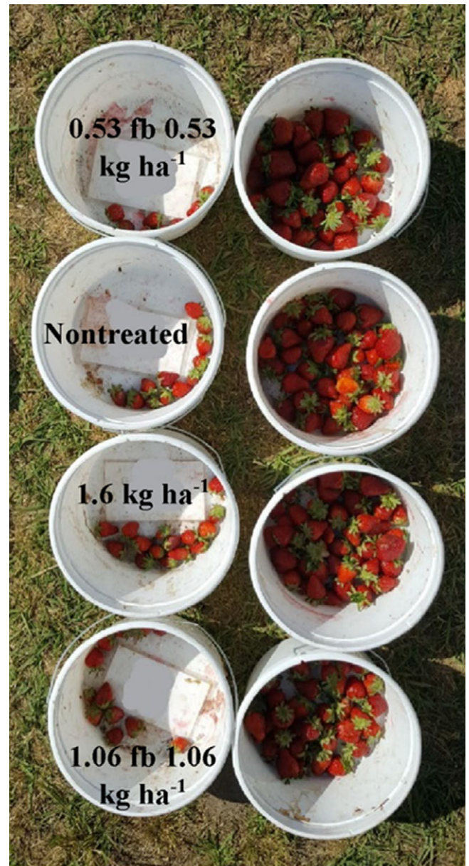
Figure 3. Week 4 of 2020 strawberry harvest in Clayton, NC, with strawberry fruit sorted by nonmarketable (left) and marketable (right). Treatments from top to bottom: 0.53 followed by 0.53 \text{ kg ha}^{-1} nontreated, 1.6 \text{ kg ha}^{-1} alone, and 1.06 followed by 1.06 \text{ kg ha}^{-1} .

The experimental design was a randomized complete block with treatments replicated four times. Each replicate had 20 strawberry plants and consisted of two 3-m-long rows: the first a border row and the second row used for data collection. Treatments included 2,4-D (Embed® Extra) at 0.53 \text{ kg ae ha}^{-1} alone or followed by (fb) 0.53 \text{ kg ae ha}^{-1} , 1.06 \text{ kg ae ha}^{-1} alone or fb 1.06 \text{ kg ae ha}^{-1} ,