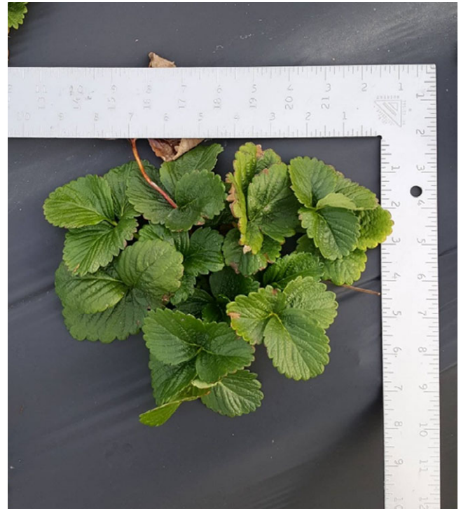
Figure 2. Strawberry canopy measurements determined by measuring the widest part of the plant canopy and then the width perpendicular.

30 d before transplanting (Boyd and Reed 2016). The study confirmed the same results for EPTC, fomesafen, halosulfuron (5 and 10 g ai ha -1 ), EPTC plus S -metolachlor (229 + 107 g ai ha -1 ), fomesafen plus S -metolachlor (42 + 107 g ai ha -1 ), and napropamide plus oxyfluorfen when applied to the bed surface after fumigation and before plastic mulch was laid. Research has been conducted to evaluate clopyralid applied POST during fruiting to control weeds in the planting hole. Hunnicut et al. (2013) observed foliar injury <5% and up to 37% from clopyralid at 66 (maximum registered rate) and 261 g ha -1 POST, respectively. However, in the same study, marketable yield was 104% and 98% from strawberry treated with 66 (maximum registered rate) and 261 g ha -1 clopyralid, respectively, compared to the nontreated control. Clopyralid treatments were also compared to 2,4-D amine POST over strawberry grown on polyethylene mulch to determine efficacy on vetch and strawberry tolerance (McMurray et al. 1996). In these studies, strawberry exhibited ≤6% injury from all clopyralid treatments, and 2,4-D caused 5% and 12% injury when applied to strawberry in the 7- to 9- and 9- to 10-lf stages, respectively, and