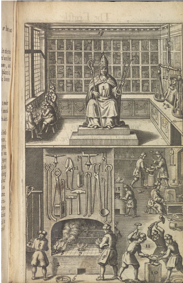
Figure 1. William Badcock, A Touchstone for Gold and Silver Wares (London, 1677). Frontispiece showing the interior of a goldsmith's shop (top) and the assay workshop at Goldsmiths' Hall (bottom).