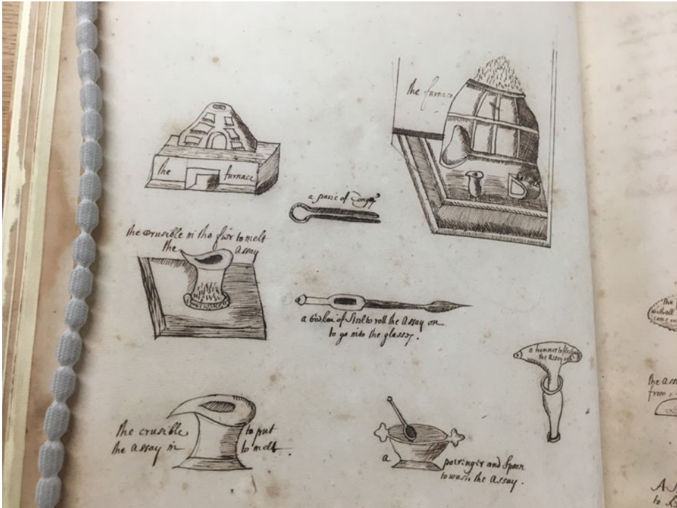
Figure 4. Mint and Moneta , the National Archives, MS T 48/92, fo. 12v. Illustrations of equipment and instruments used for assay, including furnaces.

being described, and they capture the (early modern, and modern) reader’s attention. The drawings in the Mint manuscript, in the same hand as the text, might further have been an attempt at demonstrating the expertise of the author.