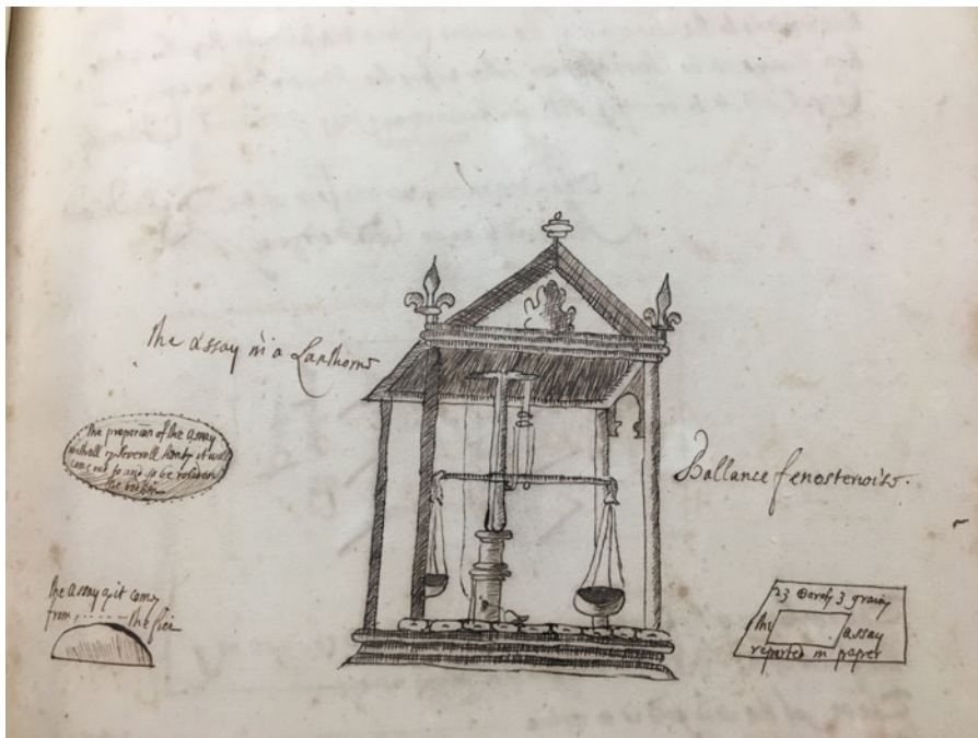
Figure 5. Mint and Moneta , fo. 13r. Illustrations of equipment and instruments used for assay, including a set of balances.

importance of this collective decision-making dimension. Groups of three or four citizens would apply their full range of senses and technical abilities when making judgements about material quality. 91