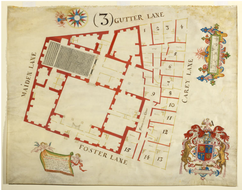
Figure 2. John Ward, Goldsmiths' Hall: Plan of Ground Storey , c.1691, watercolour, Goldsmiths' Company, London. The Assay Office was located to the right-hand side of Goldsmiths' Hall (from the perspective of a visitor at the entrance gates on Foster Lane), and to the immediate left of Flower-de-Luce Court. The numbered spaces represent rental properties.

book of ordinances and statutes, compiled in September 1478, included appropriate penalties 'if any man reveals the secrets of his craft'. 28 More specifically, the trials undertaken by institutional assayers were meant to be discreet and private in order to uphold the allegedly impartial nature of the process, and they were thus ideally concealed from all but the employees of the workshop and institutional authorities. And yet this very secrecy, and apparent lack of transparency concerning the deputy assayer's workshop activities, repeatedly led to complaints and controversies. In the hands and judgments of London's assayers lay the purity of specie and the livelihoods of artisans and merchants. The honesty and quality of their work also reflected upon institutional reputations. Thus a balance was continually renegotiated between 'secrecy' and 'openness' in