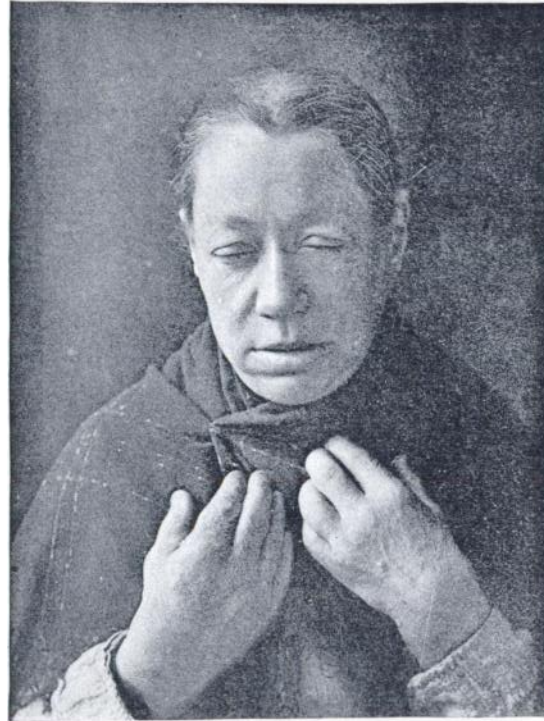
Fig. 1. M.B. Before commencing treatment.