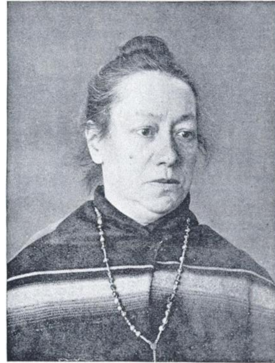
Fig. 2. M.B. A year later; after treatment.