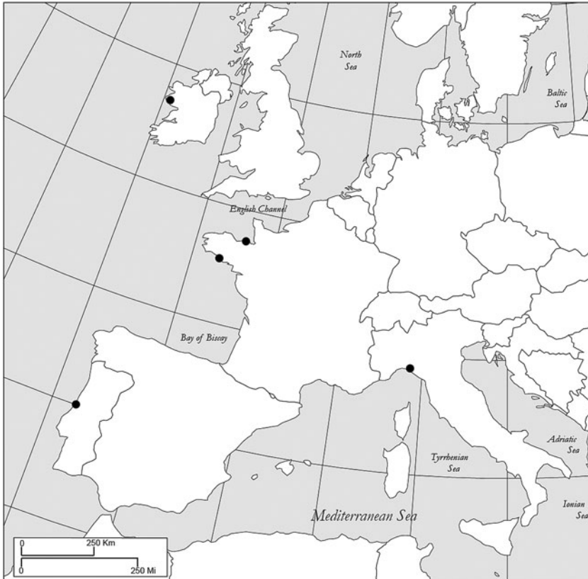
FIG. 2. Map of Europe showing localities of collections of Lecidea phaeophysata .