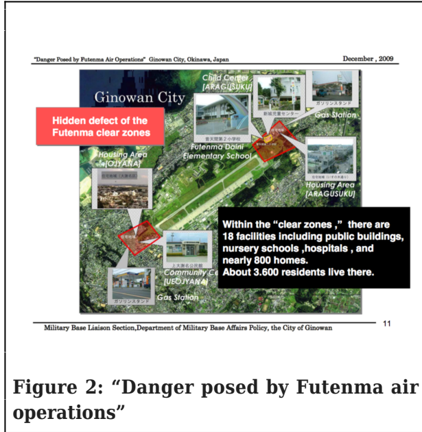
Figure 2: “Danger posed by Futenma air operations”

installation” [Note 4 to table 2]. Namely, the regulations specify that no structures within the so-called clear zones should be present either on or off military installations.