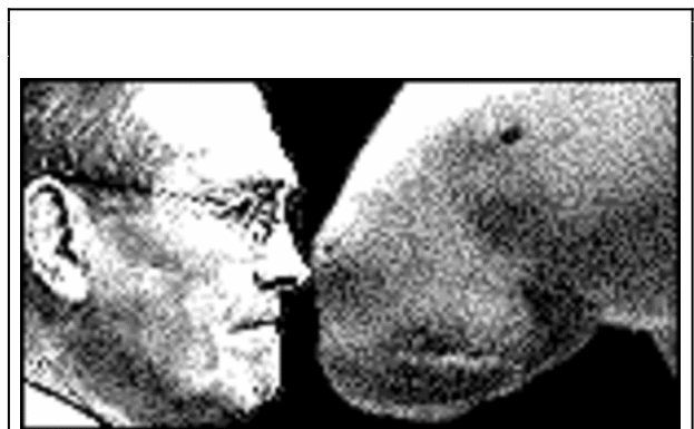
Figure 5: Graphic illustration of former