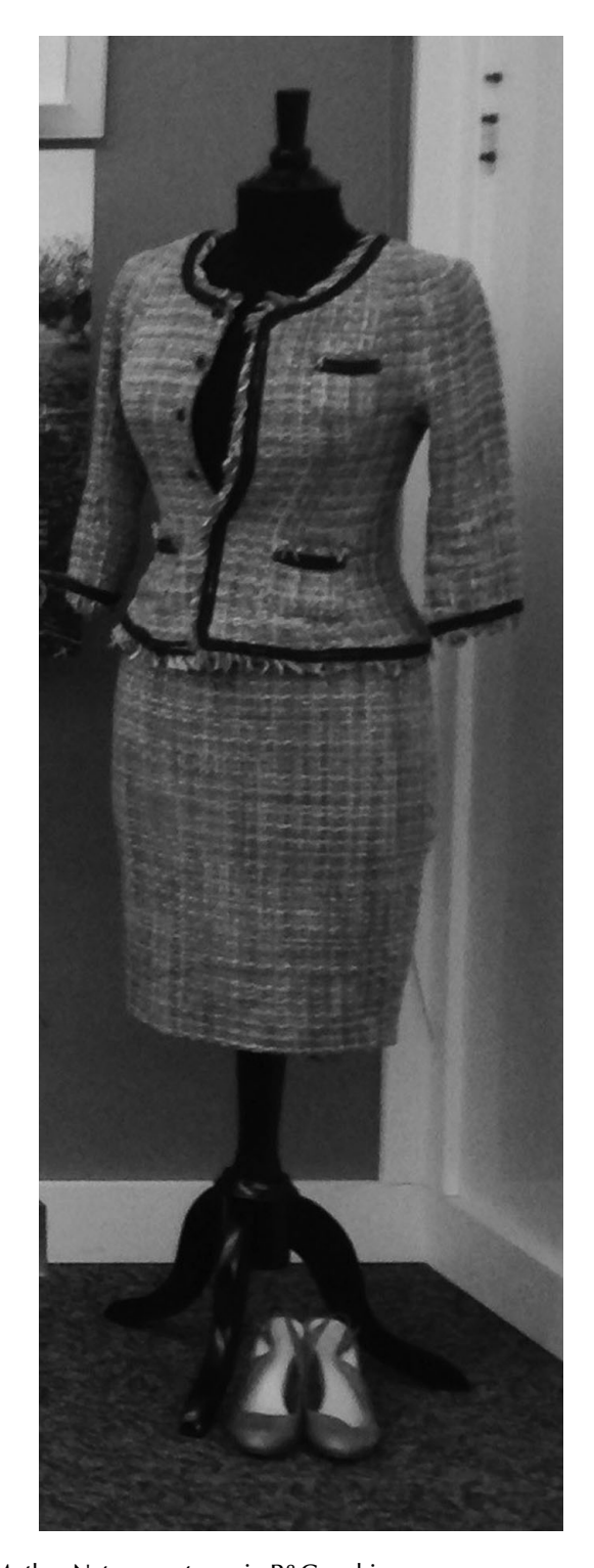
Figure 5 Mother Nature costume in P&G archives.