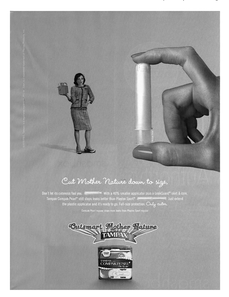
Figure 1 "Cut Mother Nature down to size."

P&G's archives at the corporation's headquarters in Cincinnati, Ohio, are no exception.<sup>2</sup> In lieu of limited access, historians can draw on the official Tampax histories commissioned by the original owners, Tambrands Inc., and the current owners, P&G: Rising Tide and Small