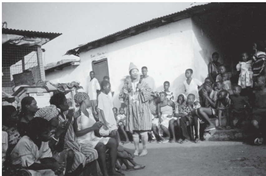
FIGURE 3 Tigare during a possession performance in Teshi

possessed. In order to contextualize the political inclination of this specific group of people, a brief history of Ghanaian politics is warranted.