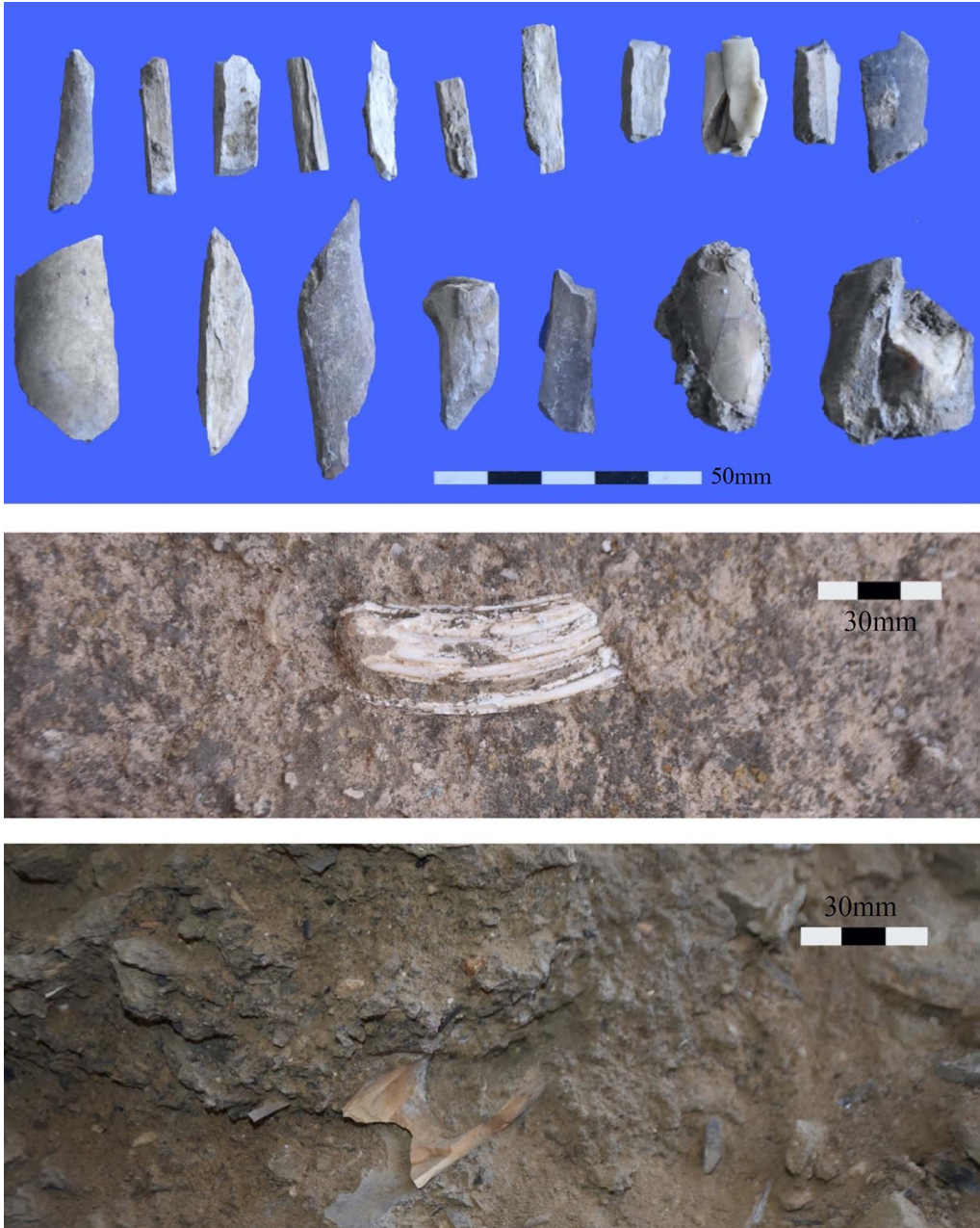
Figure 5. Bone fragments collected in Şikefta Elobrahimo Cave and photographed in the field (figure by E. Kodaş).