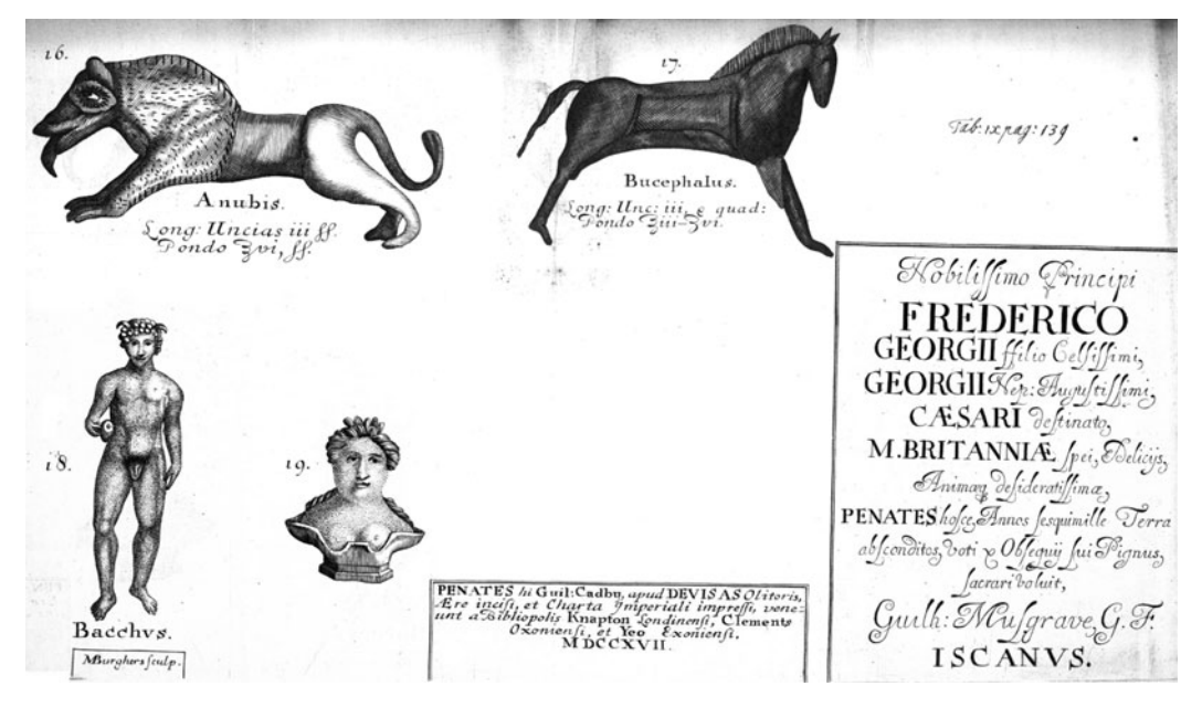
FIG. 3. The Southbroom hoard: Musgrave 1719, table IX. (Courtesy of the Bodleian Libraries, University of Oxford. Manuscript Gough Somerset 53)

1719 (FIGS 2–3). The illustrations appear to be fairly accurate — both in direct comparison with the surviving figurines in the British Museum and as noted by Stukeley — although it is clear that a certain amount of interpretation has been undertaken as is often the case in antiquarian drawings.<sup>5</sup> The illustration of the picture lamp shows that the discus was decorated with the figure of a curled sleeping dog. Roman picture lamps depicting curled dogs, sometimes with a puppy, occur in both bronze and clay and a first-century example is known from Colchester.<sup>6</sup>