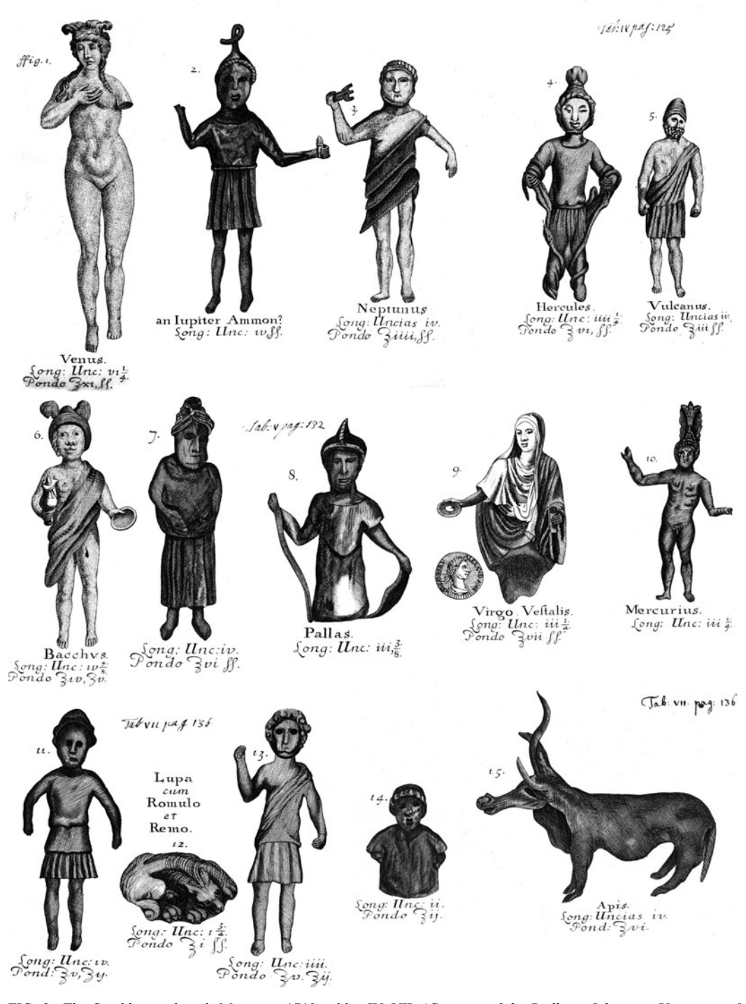
FIG. 2. The Southbroom hoard: Musgrave 1719, tables IV–VII. (Courtesy of the Bodleian Libraries, University of Oxford. Manuscript Gough Somerset 53)