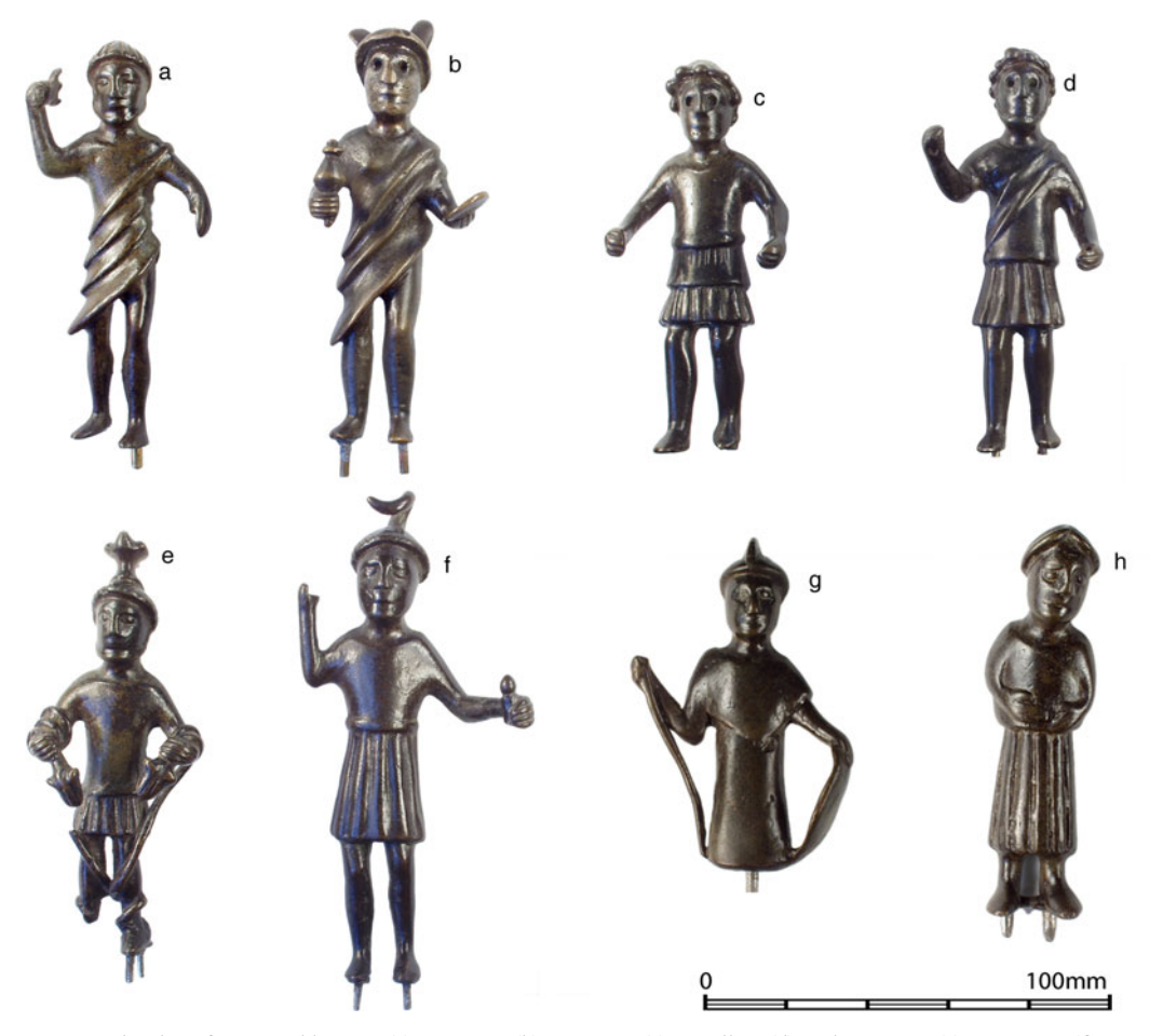
FIG. 4. Figurines from Southbroom: (a) Neptune; (b) Mercury; (c) Sucellus; (d) Vulcan M13; (e) Mars M4; (f) Mars M2; (g) Minerva; (h) Mother Goddess M7.

missing figurines could have been acquired by a collector who valued the classical pieces but rejected the stylised ones.<sup>8</sup> However, while antiquaries may have considered the more native-looking pieces to be of inferior quality, they obviously were regarded highly enough in Roman times to take their place alongside classical figurines.