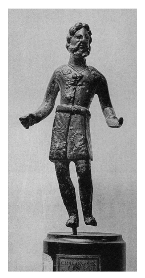
FIG. 5. Sucellus from Chalon-sur-Saône, France. (After Armand-Calliat 1937, pl. XIII)