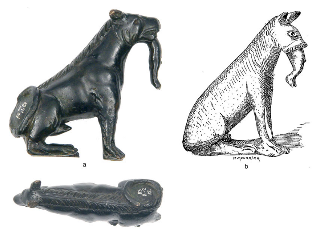
FIG. 11. (a) The wolf-god from Woodeaton (Oxon.). Scale 1:1; (b) The carnivore from Fouqueure, France. ((a); (b) Chauvet 1901, fig. 10)

The other examples in this group are all seated and include two figurines from Llys Awel (Conwy).<sup>46</sup> These two creatures have open mouths from which protrude tongues, one of which is particularly long and wavy (FIG. 10). Their bodies are decorated with an incised pattern of cross-hatching and they have a dorsal ridge worked with a herringbone pattern. Their maleness is also emphasised in the depiction of the genitals. Other objects found with these dogs are another highly stylised dog in La Tène style, a Mercury figurine and three plaques, two of which also depict dogs.