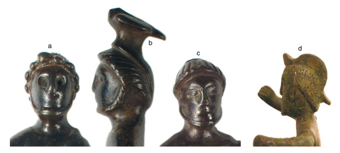
FIG. 6. The beards on: (a) Vulcan M13; (b) Mars M4; (c) Neptune; (d) the Dragonby Mars. ((a)–(c) Reproduced by kind permission of the Trustees of the British Museum; (d) Reproduced by kind permission of North Lincolnshire Museum Service)