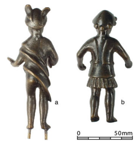
FIG. 7. The rear of (a) Mercury and (b) Sucellus.

Slaughter (Glos.).<sup>24</sup> It would, therefore, appear that the raven was associated with various deities, including Mars, in Roman Britain if not before. The importance of the raven in the ritual life of Iron Age and Roman Britain is further evidenced by the inclusion of raven bones in deliberately placed deposits at a number of sites during those periods.<sup>25</sup>