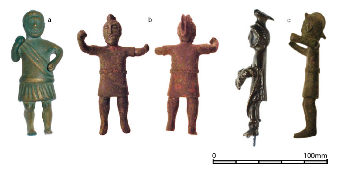
FIG. 8. (a) Vulcan from North Bradley (Wilts.); (b) Mars from Dragonby (North Lincs.); (c) Profiles of Mars figurines from Southbroom (M4) and Dragonby.

The first figurine to be considered is a Vulcan found by a metal-detectorist in North Bradley (Wilts.) (FIG. 8a).<sup>37</sup> This figure is rather stockier than the figurines in the Southbroom hoard, but does share some similarities with them, including the position and style of the legs, the straight pleats of the skirt, and the awkward depiction of the arms with simple socketed hands. The use of a raised moulding to depict the beard is perhaps more significant, since this is not a feature commonly seen elsewhere in Britain other than on the Southbroom figurines. The bristles and hair underneath the pileus of the North Bradley Vulcan are depicted by short s-shaped grooves. However, unlike the Southbroom figurines, the pleats of his skirt are decorated with horizontal hatching at the front and his eyes and mouth are more clearly defined. Henig notes the similarities between this figurine and those in the Southbroom hoard, but also points out that the depiction of the beard is similar to that on a Mars from Dragonby (FIG. 6d).<sup>38</sup> The Dragonby Mars also has a small slit mouth, wedge-shaped nose and almond-shaped raised eyes; he has a full beard which leaves only a small part of the face uncovered and the hair of his