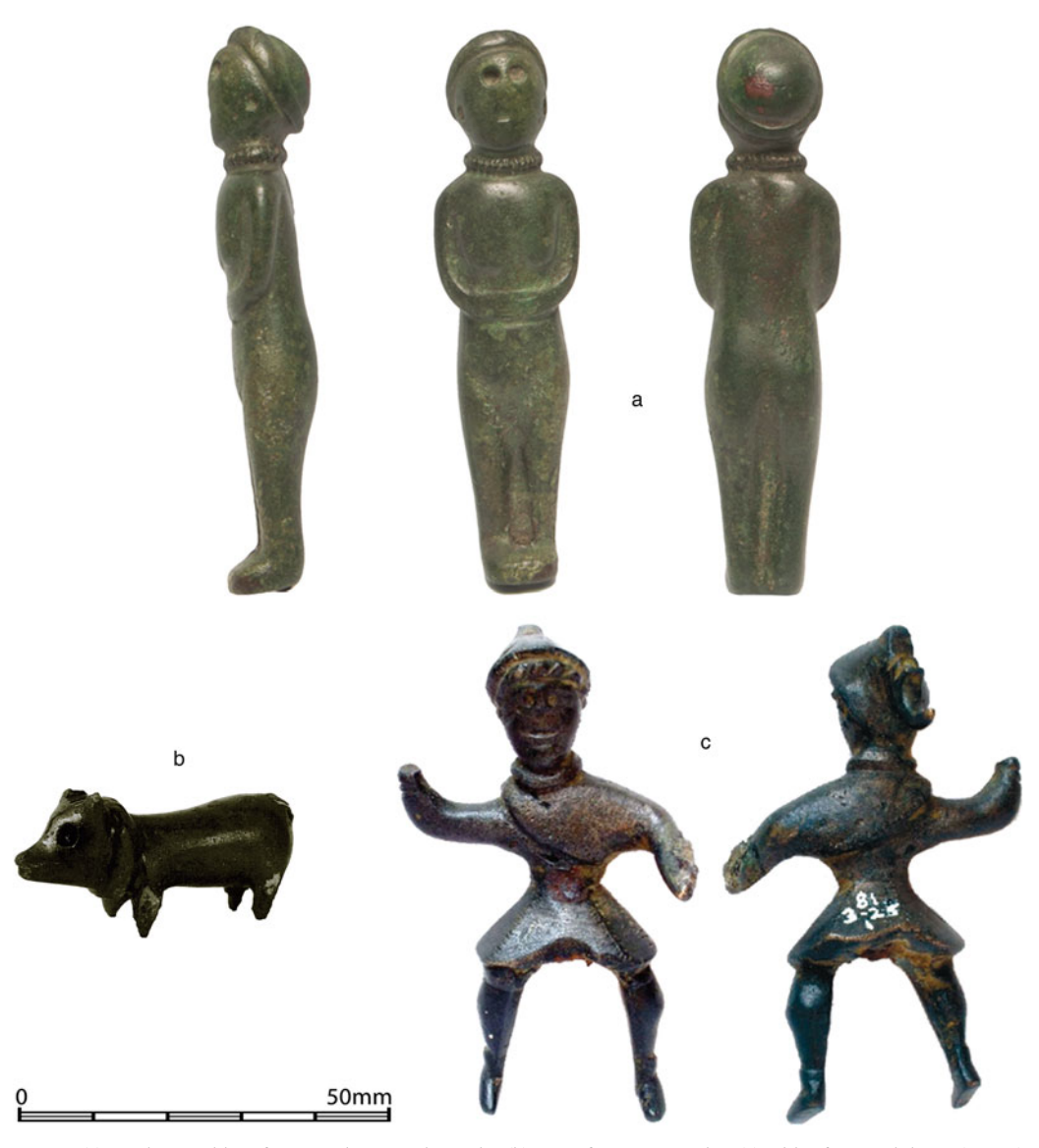
FIG. 9. (a) Mother Goddess from Henley Wood temple; (b) Boar from Motcombe; (c) Rider from Ashdown (Oxon.).