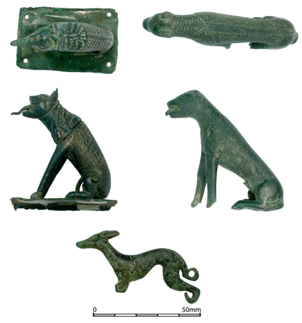
FIG. 10. Dogs from Llys Awel, Conwy.

was published as Anubis by Boon,<sup>44</sup> but is now thought more likely to be another form of dog-like creature. The illustration published by Musgrave shows a powerful standing creature with protruding tongue, a mane from the back of his head to shoulders, and rough bristled coat across the forelegs, neck and shoulders (FIG. 3, no. 16).<sup>45</sup>