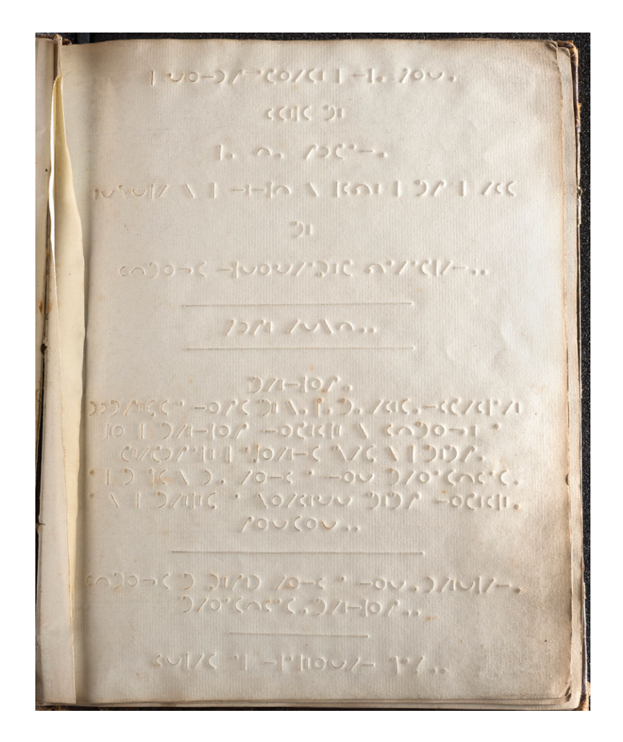
Figure 17. (Color online) Page opening from The Gospel According to Saint John , edited by T. M. Lucas (Bristol: Bristol Society for Embossing and Circulating the Authorised Version of the Bible, 1837). Lucas type.

encompasses a modified version of the Roman alphabet. The letters in Moon's system are simplified to enable easier haptic reading – the letter D, for instance, looks like a backwards C. This system was the most widely used embossed script prior to the global adoption of braille from 1870 onwards and was successful, in part, due to its relatively cheap production – a result of Moon's invention of a low-cost yet robust stereotype. One of the most surprising facts about the Roman-based scripts is that Moon's system is still in use (albeit infrequently) today.