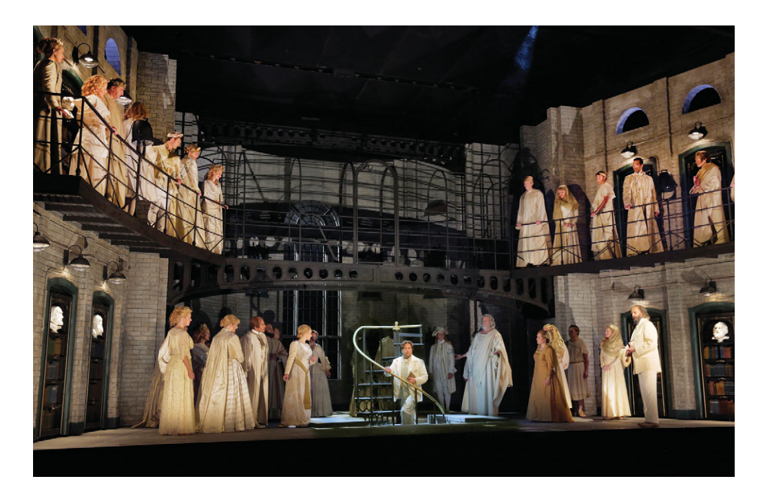
Figure 13. (Color online) "Oscar Becomes Immortal." http://www.santafeopera.org/pressphotos/landing. aspx. Web. 6.16.14.

who is no longer the inimitable Wilde but now a veritable and verified Man for the Ages (Figure 13). From what I understand, audience members gamely attempted to figure out which Immortal was which, based, apparently, on era-appropriate costume design (Isaacs). In an extraordinary lapse of artistic judgment and biographical elision, then, this starched papier-mâché incarnation of the Immortals is far more grotesque than the amateur sexually repressed theatricals of my fundamentalist youth.