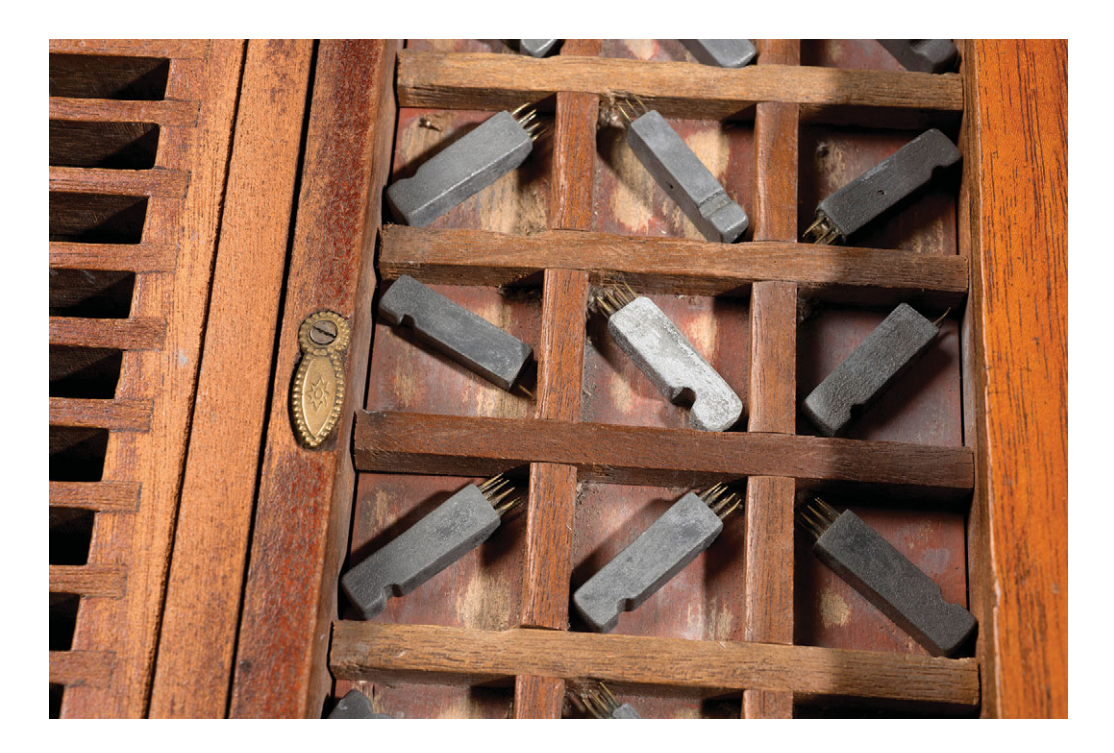
Figure 18. (Color online) Klein Type Box, c. 1840. Folding box, green felt backing to type board, 24 lines, lead type. With key and catches.

Collins's 1872 novel Poor Miss Finch ; and H. G. Wells's 1904 short story "The Country of the Blind." Wells's short story illustrates an interest not just in blindness but in the enhanced perceptive touch of the blind, a compensatory effect of blindness explored in depth earlier by Collins. Victorian blindness and prosthesis expert Vanessa Warne writes that such cultural representations of blind reading reveal more to us about how the blind were imagined in Victorian society than they do about the lived experiences of visually disabled people: more often than not such depictions attest to the idolisation of blind people by the sighted, who focussed upon the achievements of blind readers and the progress of contemporary technology and education systems while ignoring the various difficulties, complexities, and nuances of learning and performing blind reading in this period ("On Bridges and Streets: The Public Face of Raised-Print Readers").