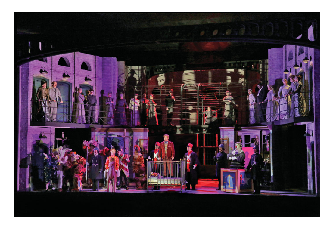
Figure 10. (Color online) "Jack-in-the-Box Justice." Illustrations of Oscar performance. http://www. santafeopera.org/pressphotos/landing.aspx. Web. 6.16.14.

writer Ada Leverson (whom he affectionately named "The Sphinx"), provides him asylum in her children's nursery when he rejects plans to steal off to the continent to avoid the trial. Thus, as imagined by Cox and Morrison, Wilde is caught in a supernatural night scene, in which the nursery toys metamorphose into enormous jurors, bailiff, and vile spectators, with the bars of the crib transmogrifying into a jail around Wilde and the judge popping up grotesquely as a Jack-in-the-Box, a worthy mise en scene depicting the real-life bizarre proceedings (Figure 10).