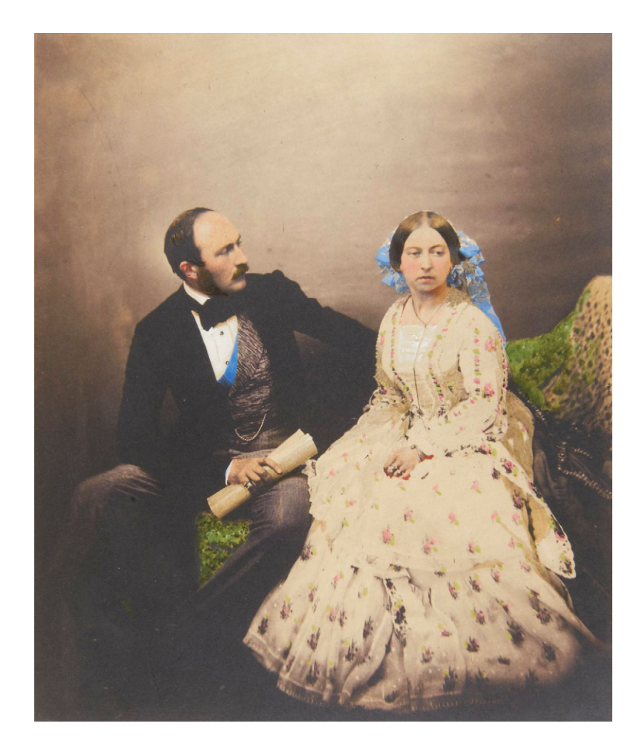
Figure 8. (Color online) Roger Fenton, The Prince and the Queen , 1854.

Painters called "the use of pictures." Various sections of the exhibit framed the questions, and answered them, in different ways.