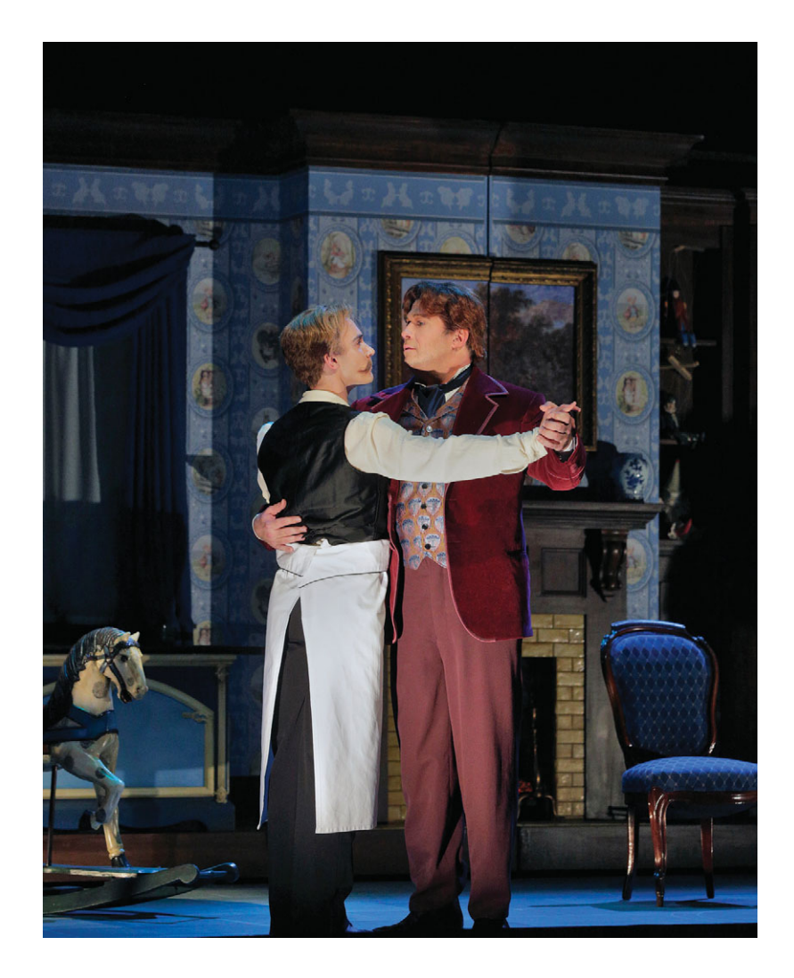
Figure 12. (Color online) "Uranian Love: Bosie and Oscar." http://www.santafeopera.org/pressphotos/ landing.aspx. Web. 6.16.14.