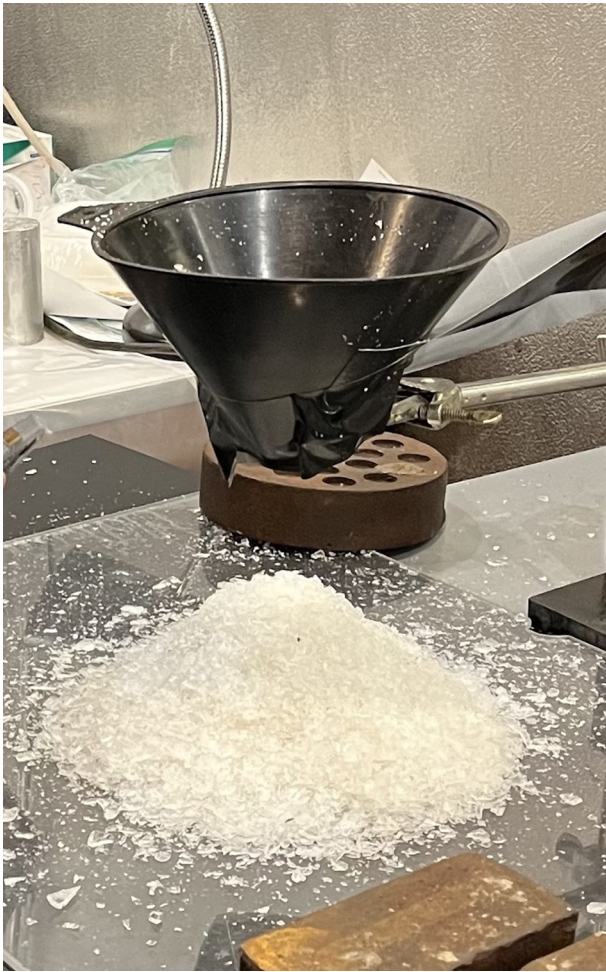
Figure 1. Image depicting the experimental setup and showing a pile formed from a mixture of 8–16 mm particles of ice +0.1 volume percent wood ash.

addition of 0.1 vol. percent essentially doubles the angle, from \sim 12 to 28^\circ . The addition of 0.2% increases the angle further, to \sim 33^\circ . Greater amounts have a progressively lesser effect, and the AOR tends to reach a limit of 35 to 40^\circ upon the