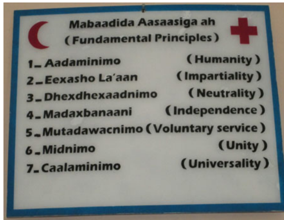
Figure 2. The Fundamental Principles in Somali.

Interviews with staff, volunteers and other Red Cross members operational in Somalia show that the leadership of the Society, based on the Fundamental Principles, is a key element of its ongoing success. With leadership made up of a diverse and balanced membership from a range of clans, the principle of neutrality is reinforced even if conflict actors test the boundaries. In addition, strong and representative national leadership is linked to local and well-connected branch managers, all united by the Fundamental Principles. This allows the organization to brand itself as “a national organisation which is politically neutral ... and, as such, distinguish itself from all other humanitarian organisations in Somalia”. 40 This enables the Society to acquire and maintain access with a wide variety of groups across the country, unlike any other national organization (Figure 2 shows the Fundamental Principles in Somali including their English translation).