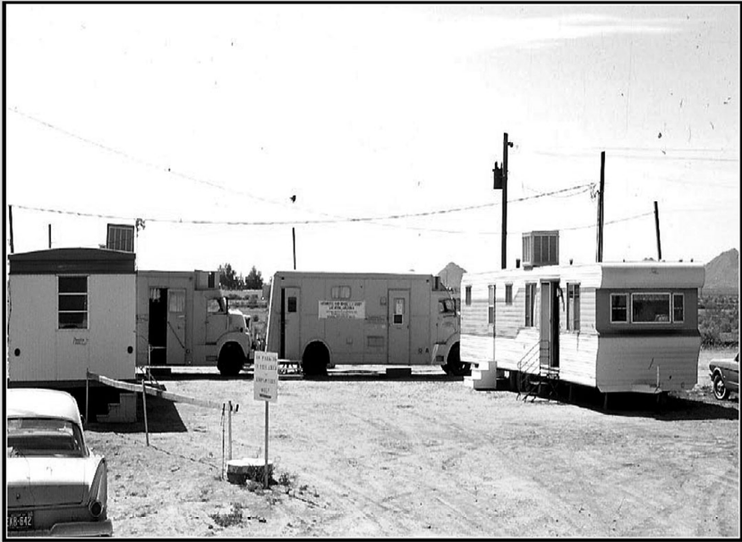
Figure 7.5 NIH trailers at data collection site, circa 1963.