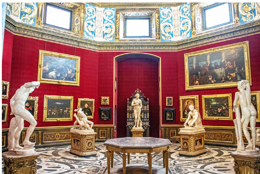
Figure 1.2 Bernardo Buontalenti, The Tribuna (1581–1583). The Wrestlers (deep left); Venus de' Medici (center); The Listening Slave (deep right). The Uffizi Gallery, Florence, Italy.

example of proportion, taken on tours in travel guides as a standard of excellence, and insistently included in novels and poems. 16