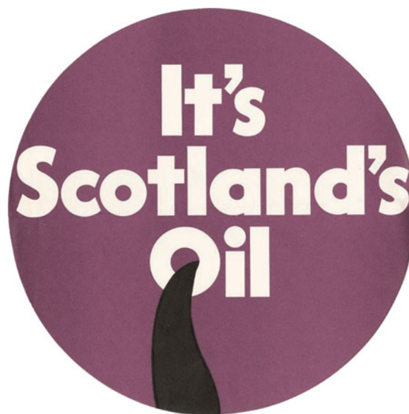
Figure 3: Scotland's Oil : The SNP's campaign to keep a larger share of Scotland's offshore oil was launched in September 1972.

To date Crawford and Boyle's Opinion offers the most detailed and substantive analysis of Scotland's potential legal status in international law following independence. States are legal entities in international law with the capacity to enter into treaty with other states. For example, when Scotland entered into the Treaty of Union in 1706 with England it did so as an autonomous