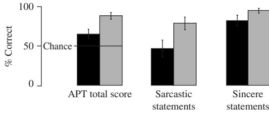
FIG. 1. Per cent correct of sincere (20) and sarcastic (20) statements ( p < 0.0001 ). Error bars represent s.d. for the mean scores represented in the graph. ■, Schizophrenia patients; □, healthy controls.

consists of 21 sentences of neutral content on audiotape. The sentences are spoken by male and female speakers to convey one of six different emotions (happiness, anger, fear, sadness, surprise, or shame). Participants, in a forced choice manner, chose one of the six emotions for identification. Performance is calculated based upon the percentage of correctly identified sentences.