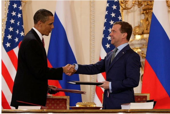
Barack Obama and Dmitry Medvedev after signing the “New Start Treaty in Prague in April 2010

President Obama in 2013 announced the possibility of further reductions of “deployed strategic nuclear weapons by up to one-third,” i.e., down to 1000-1100 weapons, ideally in negotiated cuts with Russia. 3 This language left open the possibility for unilateral cuts. It is worth recalling that, in 2000, President Putin had offered to cut to 1,000-1,500 warheads for each side, but U.S. President Clinton rejected it at the time. 4