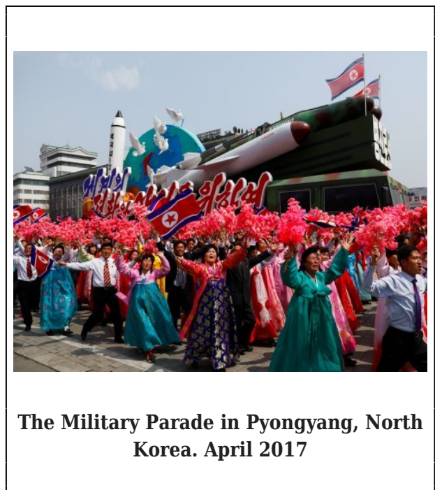
The Military Parade in Pyongyang, North Korea. April 2017

Secretary of State Rex Tillerson has declared that with regard to North Korea “the policy of strategic patience has ended. We are exploring a new range of diplomatic, security, and economic measures. All options are on the table.” 49 Tillerson explained that this includes the use of force: “Certainly, we do not want to—for things to get to a military conflict. [...] If [the North Koreans] elevate the threat of their weapons program to a level that we believe requires action, that option is on the table.”