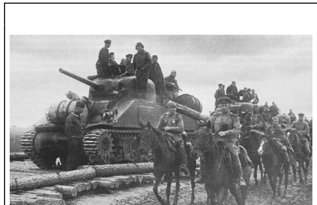
Soviet forces invade Manchuria

And then, after midnight of August 8-9, Soviet Far East time, two in the morning Japan time, Soviet tanks rolled into Manchuria, and planes attacked Japanese forces. This surprise attack was totally unexpected. It was only then, on the morning of August 9, that the Supreme War Council was convened for the first time. It had not met following the atomic bomb on