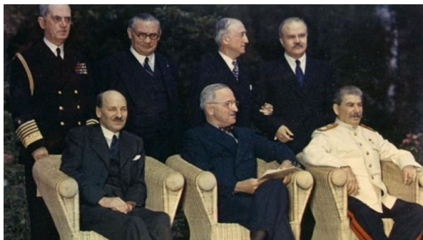
Atlee, Truman, Stalin at Potsdam

followed this policy faithfully. This was because Japan had engaged in military aggression igniting the war (an unjust war) and had committed numerous atrocities against American and Allied soldiers (violations of justice in warfare). In order to defeat Japanese militarism so that Japan could never rise again as a military power, the United States and its allies sought to impose unconditional surrender. But as the war developed, certain very influential people within the government – such as Secretary of War Henry Stimson, Secretary of the Navy James Forrestal, and Deputy Secretary of State and former Ambassador to Japan Joseph Grew – thought it necessary to define what “unconditional surrender” exactly meant. Particularly important was the status of the emperor. If the United States were to insist on unconditional surrender, particularly if it were to insist on trying or punishing the emperor, as some within the administration insisted, they were convinced that the Japanese would fight on to the very last man. Therefore, they argued, in order to terminate the war, the US would have to define the terms in such a way that it could allow the Japanese to preserve the monarchical system, even under the current dynasty.