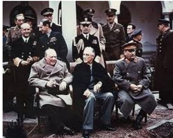
Churchill, Roosevelt and Stalin at Yalta

With regard to the first assumption, I have to point out that two very important options were available to Americans. And in fact, the options were presented in the course of the deliberations of the US government. The first option was to welcome Soviet entry into the war. By the end of 1944, US leaders had come to the conclusion that in order to force Japan to surrender, invasion of Japan's homeland would be necessary. The successful execution of this strategy would require Soviet entry into the war in order to pin down the Japanese forces in China and Korea.