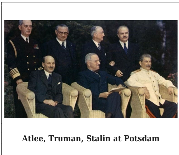
Atlee, Truman, Stalin at Potsdam

followed this policy faithfully. This was because Japan had engaged in military aggression igniting the war (an unjust war) and had committed numerous atrocities against American and Allied soldiers (violations of justice in warfare). In order to defeat Japanese militarism so that Japan could never rise again as a military power, the United States and its allies sought to impose unconditional surrender. But as the war developed, certain very influential people within the government – such as Secretary of War Henry Stimson, Secretary of the Navy James Forrestal, and Deputy Secretary of State and former Ambassador to Japan Joseph Grew – thought it necessary to define what “unconditional surrender” exactly meant. Particularly important was the status of the emperor. If the United States were to insist on unconditional surrender, particularly if it were to insist on trying or punishing the emperor, as some within the administration insisted, they were convinced that the Japanese would fight on to the very last man. Therefore, they argued, in order to terminate the war, the US would have to define the terms in such a way that it could allow the Japanese to preserve the monarchical system, even under the current dynasty.