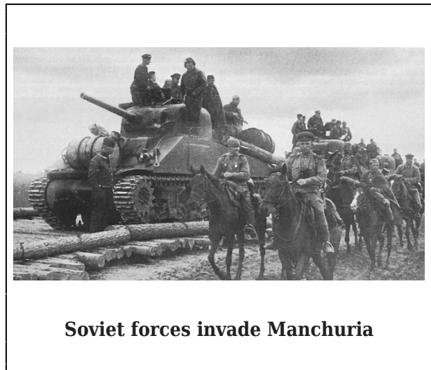
Soviet forces invade Manchuria

And then, after midnight of August 8-9, Soviet Far East time, two in the morning Japan time, Soviet tanks rolled into Manchuria, and planes attacked Japanese forces. This surprise attack was totally unexpected. It was only then, on the morning of August 9, that the Supreme War Council was convened for the first time. It had not met following the atomic bomb on