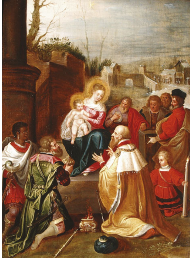
FIGURE 1. The Adoration by the workshop of Frans Franken II, Antwerp, ca. 1620, oil on oak, 45 cm × 32 cm.

The demonstration of the feasibility of magnetic fusion energy requires that a broad range of issues be addressed. Many of these issues are addressed by basic properties of stellarators: steady-state maintenance of the magnetic configuration; no possibility of the loss of positional equilibrium, which is associated with disruptions; and no requirement to have a plasma current greater than 5 MA, where the problem of runaway electrons becomes severe. An important property, which reduces the cost and time for fusion energy development, is that stellarator plasmas are subject to external control rather than being in a self-organized state. This removes many uncertainties in the extrapolation from smaller experiments to the reactor scale. A review of stellarators has been recently published by Helander (2014).