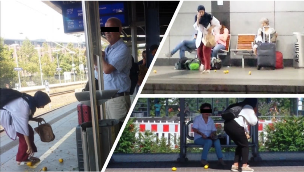
Figure 1. Experiment in action.

helping behavior toward ingroup and outgroup members in an experimental design that is itself a measurement strategy focused on identifying the effect of temperature on behavior while abstracting from other possible causes of discrimination.