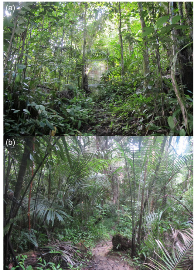
PLATE 1 Characteristic forests of (a) the hilly areas and (b) the riverine areas around Pungut Field Station (Fig. 1).

In addition, we conducted a bat survey around Pungut Field Station, north Siberut, during September–October 2013 for a total of 58 trapping nights on two transects (Fig. 1) that represented hilly (Plate 1a) and riverine areas (Plate 1b). We used four-bank harp traps and mist nets (6 × 9 m, mesh size 30–32 mm) following a standard bat survey protocol (Kingston, 2009) but with the checking of mist nets extended by 30 minutes because of the low capture rate (mean 4.88 \pm SE\ 0.80 individuals per night). We also used non-standard placement of stacked mist nets around the Station’s buildings and over a river, and examined bats hand-captured by local people. Bats were immediately released at their capture location after measurement, with identification based on Suyanto (2001). Using the collated data set from natural history collections, earlier published accounts, and our survey, we plotted a species accumulation curve, and compared our collated bat species list for Siberut with that for adjacent Sundaland landmasses (Sumatra, Malaysian Peninsula, Java and Borneo), available in Maryanto et al. (2019).