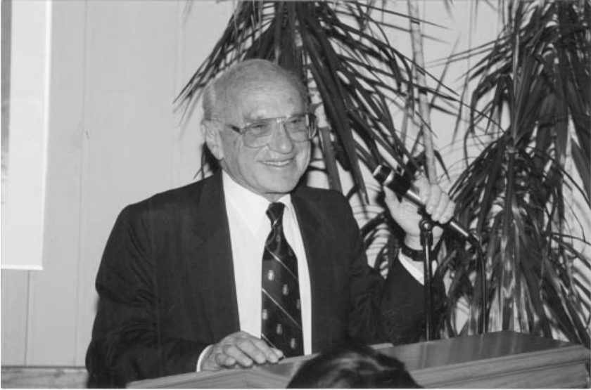
FIGURE 5. At 80th birthday party, 1992, given by Frazer Institute in Vancouver.

Friedman: I think the focus on expectations was important. But as for rational expectations, I think you have to give Bob Lucas a lot of credit for that.