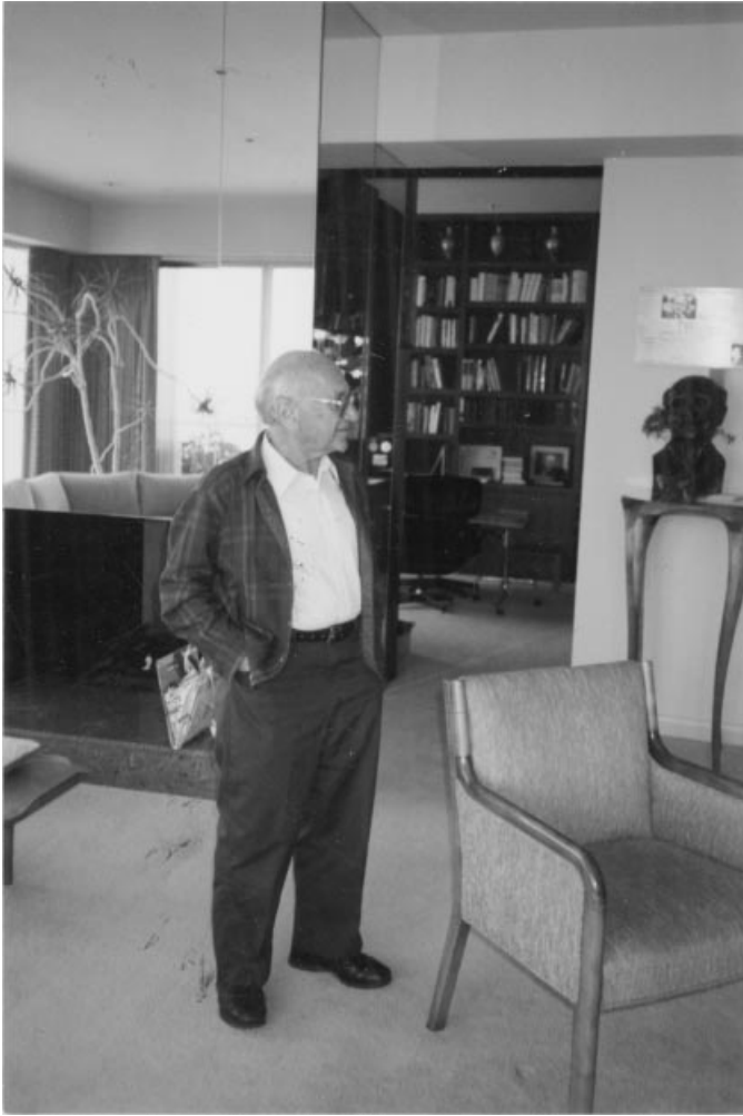
FIGURE 3. In own living room.