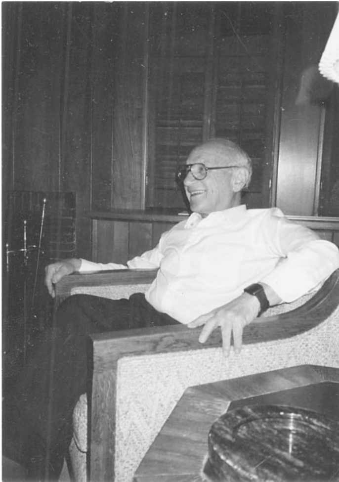
FIGURE 4. March 1992.

Friedman: That really came out of the work with Kuznets' data on incomes from professional practice. In that earlier work, I introduced the concepts of permanent income and transitory income in a simplified form, and I just carried that right over. In the professional income data research, I had three categories: permanent, quasi permanent (that's what I called the intermediate one), and transitory. Later I got it down to two.