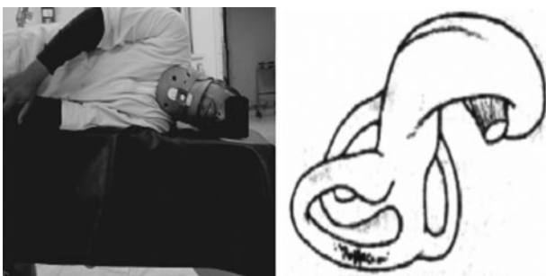
FIG. 4 Position three.