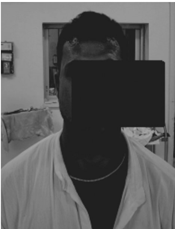
FIG. 8 Position seven.

Epley reported that his manoeuvre for treating BPPV was contraindicated in patients with cervical spine problems. 2 Other authors have supported this view. 10 This is logical, as this manoeuvre requires manipulation of the neck which may be harmful for