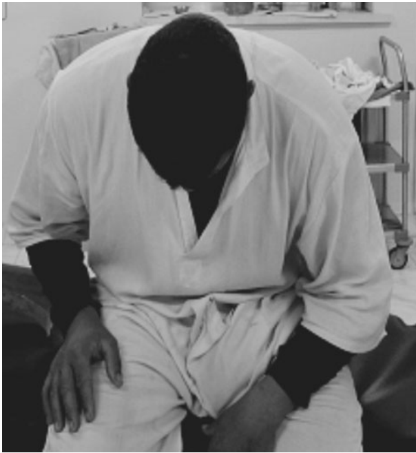
FIG. 7 Position six.

Epley reported that his manoeuvre for treating BPPV was contraindicated in patients with cervical spine problems. 2 Other authors have supported this view. 10 This is logical, as this manoeuvre requires manipulation of the neck which may be harmful for