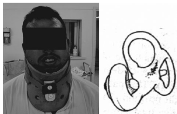
FIG. 6 Position five.