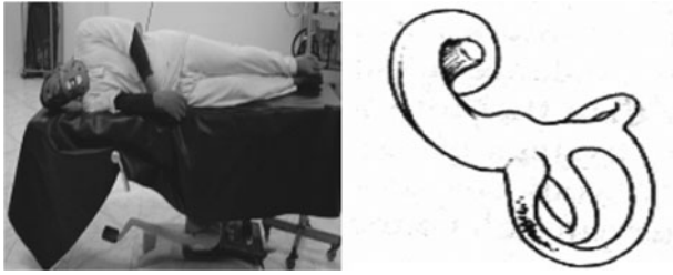
FIG. 3 Position two.