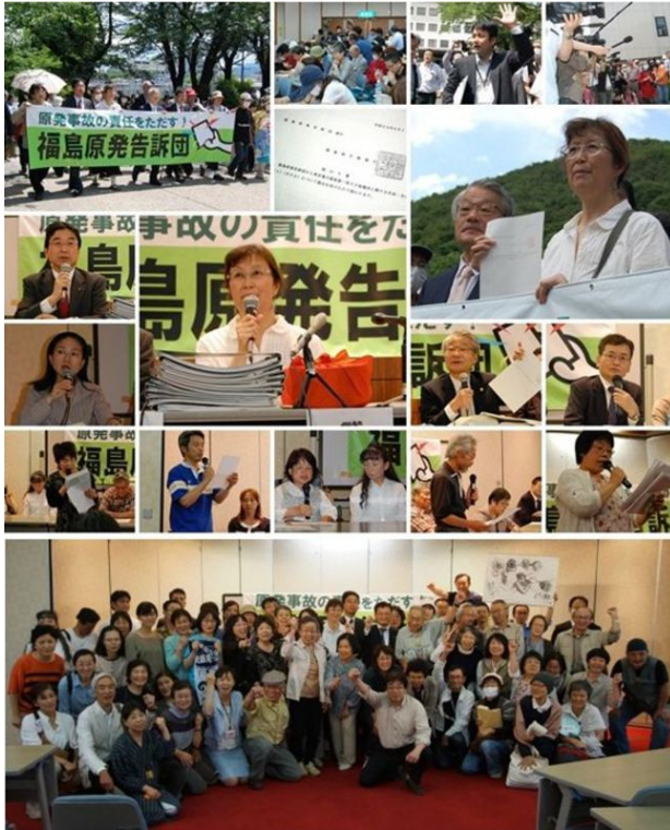
Photos from June 11, 2012, when 1324 residents of Fukushima filed a criminal complaint against 33 TEPCO executives and government officials.

Ultimately, three of them would be indicted, after citizens on two Prosecution Review Commissions overruled the non-charge decisions of Japan’s professional prosecutors.