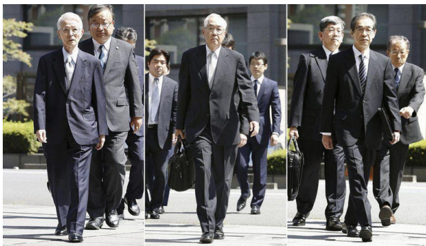
Former TEPCO executives and criminal defendants

In response to the charges of criminal negligence, the defense maintained what TEPCO spokespersons have long insisted: that the company has adhered to the “basic policy of always keeping safety first” (TEPCO, 2012). It also stressed that HERP’s report was unreliable, and that other experts disagreed with its conclusions, especially the Japan Society of Civil Engineers, whose 2002 report had been emphasized by professional prosecutors in their explanations for the non-charge decisions that were subsequently overturned by the Tokyo PRCs. More fundamentally, the defense insisted that a disaster of Fukushima’s magnitude was not “concretely foreseeable,” and it argued that its 5.7-meter (19 foot) sea wall was designed to withstand a tsunami equivalent to the maximum tide level ever recorded on the Fukushima shores. For their part, the three defendants echoed at trial what TEPCO spokespersons had been saying since the 3/11 meltdown: the safeguards they took were sufficient, but they “deeply regretted” the accident that occurred and the trouble it caused to victims and survivors. Many observers found their words hollow and insincere. Apologies of this kind – “I am not causally or legally responsible, but I am sorry” – are common in Japan. One analyst has noted the tendency to “grovel through a ritual of remorse” is so routine that “it’s a running joke” in some parts of Japanese society (West, 2006, p.285).