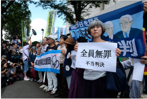
After the TEPCO Trial acquittals on September 19, 2019, a woman outside Tokyo District Court holds up a sign saying “All Acquitted: Inappropriate Judgment.”

The outcome of the TEPCO trial also raises an interesting question: what if the trial had occurred before a lay judge panel of six citizens and three professional judges? This did not happen in the TEPCO case because under Japan’s Lay Judge Law, the only crimes eligible for lay judge trial are those for which the maximum possible punishment is a life sentence or a death sentence (only about 2 percent of Japanese crimes fall into these categories). But what if?