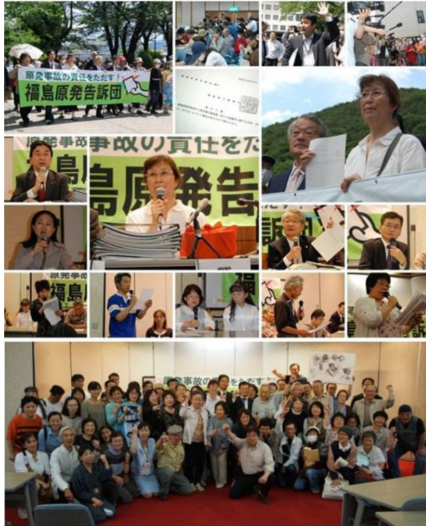
Photos from June 11, 2012, when 1324 residents of Fukushima filed a criminal complaint against 33 TEPCO executives and government officials.

Ultimately, three of them would be indicted, after citizens on two Prosecution Review Commissions overruled the non-charge decisions of Japan’s professional prosecutors.