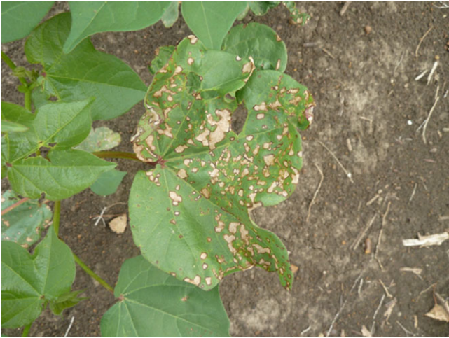
Figure 1. Cotton injury following early POST application of glufosinate + S-metolachlor. Picture was taken at 14 d after applications.

to applications containing glufosinate or S-metolachlor. However, differences in magnitude of injury decreased at each rating interval. At 3 DAA, herbicide combinations containing glufosinate or S-metolachlor had 27% injury compared to 40% from combinations containing both herbicides. At 7 DAA, herbicide combinations containing glufosinate or S-metolachlor had 18% injury compared to 28% from combinations containing both herbicides. At 14 DAA, herbicide combinations containing glufosinate or S-metolachlor had 9% injury compared to 12% from combinations containing both herbicides. At 21 DAA, herbicide combinations containing glufosinate or S-metolachlor had 7% injury compared to 10% from combinations containing both herbicides. Steckel et al. (2012) also observed that treatments receiving glufosinate + S-metolachlor produced greater injury but also negatively affected the yield of WideStrike® cotton. There were no differences in yield when associated with single degrees of contrast of the treatments evaluated.