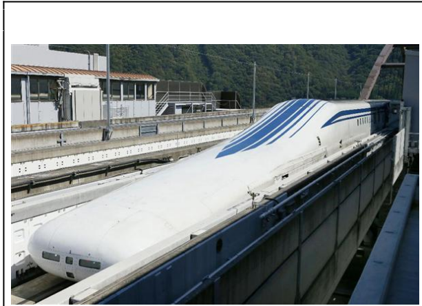
The Linear Chūō Shinkansen

fiscal spending package right after this G7 Summit suggests that the Linear Shinkansen project may be seen as the centerpiece of his fiscal policy.