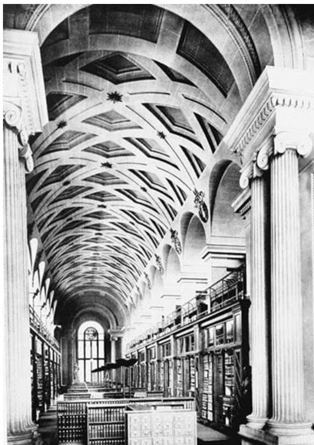
Figure 2. The first floor of the SLL in the Cockerell Building, Old Schools site. From ~1975 to 1995 Foreign & International Law materials were concentrated in this hall.