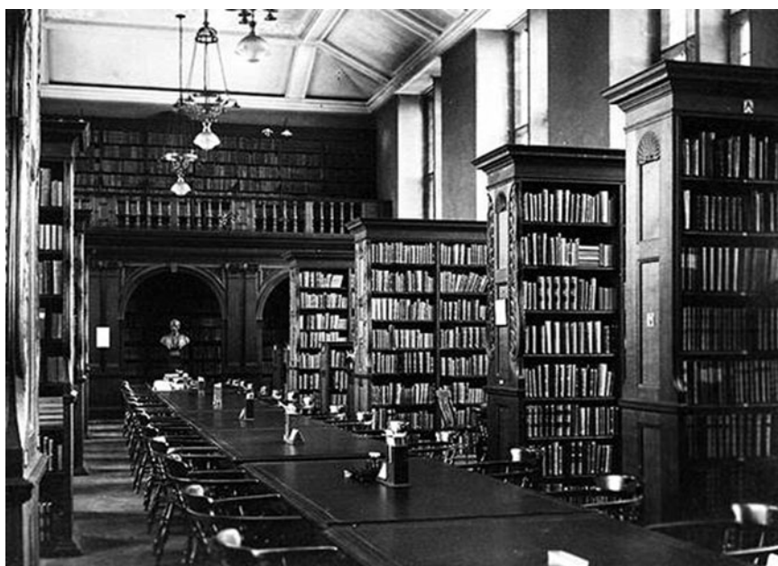
Figure 1. The SLL on the custom-built first floor of the Downing Street site, which was open for readers 1906–1935. The mezzanine area occupied by Professor Gutteridge after 1930, and which contained mainly International Law volumes, is clearly visible.

The decision to build a new Law Faculty on a site in Downing Street was taken in 1898 (Baker 1996, p. 17) after Law had been squeezed out, in 1885, of the two lecture rooms (Rooms 3 and 4) that it had occupied on the Old Schools site. Ironically, this had been to make way for the expansion of the central University Library.