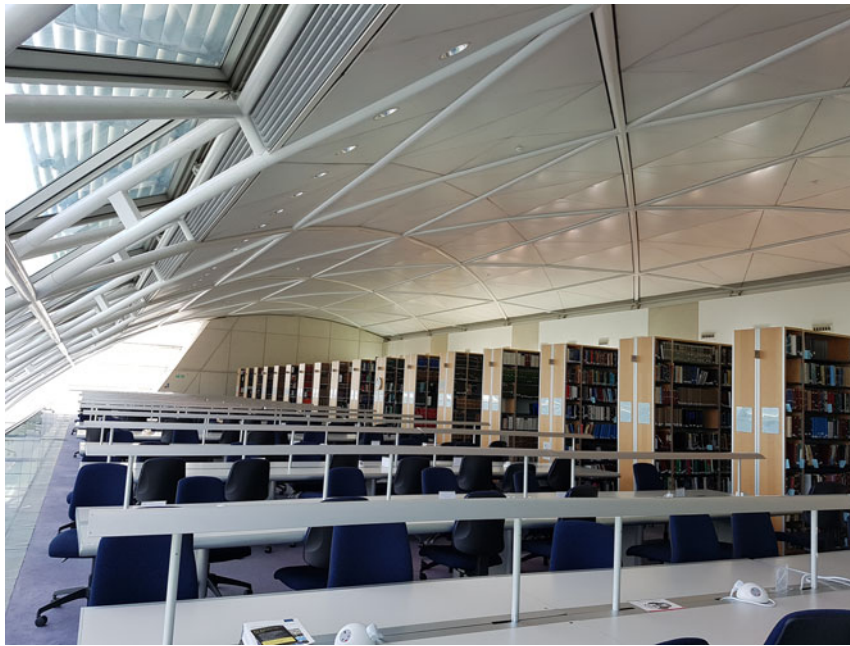
Figure 3. Third floor of the SLL in the Sir David Williams Building, West Road site. Since 1995, this floor has contained the Foreign & International collections. Photo taken by the author 2017.

onto the ground floor, by which time the collections had grown to 61,435 volumes. They increased further to 110,000 by 1991 (Steiner 1991 p. 254–55).