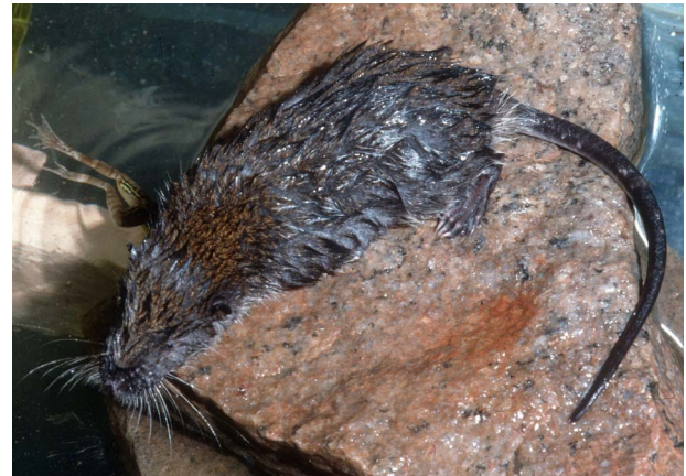
PLATE 1 The aquatic tenrec Microgale mergulus is categorized as Vulnerable because of its restricted number of known sites (10) and limited area of occupancy (< 2,000 km 2 ).

All threatened tenrec species are known from only a few individuals captured at 10 or fewer locations, making it hard to determine accurately their distribution, abundance, habitat preferences, or population trends. There have been few ecological studies and little information exists on tenrec behaviour. Few Malagasy protected areas have monitoring schemes in place. In addition, tenrec taxonomy is changing regularly as a result of ongoing genetic analyses and