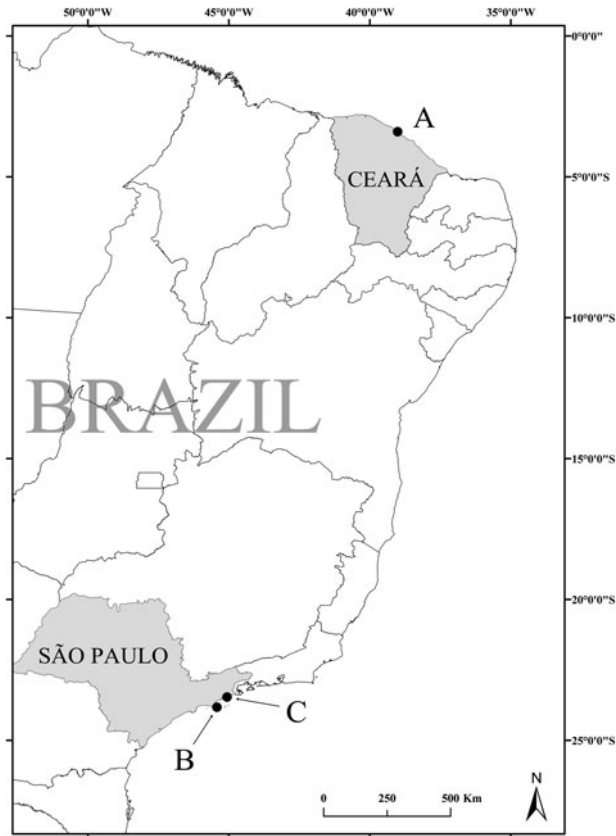
Fig. 1. Study areas: (A) Pedra Rachada Beach, Paracuru, Ceará, north-eastern region; (B) Araçá Beach, São Sebastião, São Paulo, south-eastern region; (C) Grande Beach, Ubatuba, São Paulo, south-eastern region.

(Herbst, 1791). Specimens were randomly captured manually during about 1 h by one person in low-tide periods in order to obtain specimens of different sizes, every 2 months from February 2011 to January 2012. Sampling was carried out in three different intertidal areas, in two geographic regions (Figure 1).