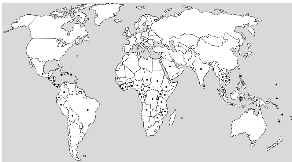
Fig. 1. Countries with known records of Hypothenemus hampei . Note: dots do not indicate the precise location where the pest was initially recorded or its present area of distribution within the respective countries.