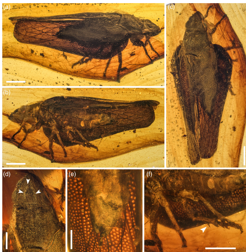
Fig. 1. (Colour online) Microphotograph of holotype (XFY10103) of Paranthoscytina xiai gen. et sp. nov., from mid-Cretaceous Burmese amber. (a) Lateral-dorsal aspect; (b) lateral-ventral aspect; (c) dorsal aspect; (d) showing details of head structure with three ocelli (white arrows) and pronotum; (e) showing details of pygofer and genitalia; (f) showing details of legs. Scale bars = 2 mm in (a–c); 1 mm in (d); 0.5 mm in (e, f).

Burmese amber harbours probably the most diverse Mesozoic palaeobiota (Ross, 2019). Among all the burmite bioinclusions, fossil insects are highly diverse. The number of species has risen exponentially over the past two decades (Ross, 2019). However, Auchenorrhyncha from Burmese amber are comparatively rare, with most of them belonging to Fulgoromorpha (or planthoppers) (Ross, 2019; Zhang et al. 2019). Recently, a few species of the infra-order Cicadomorpha (Cicadellidae, Sinoalidae and Tettigarctidae) have been reported from Burmese amber (Chen et al. 2018, 2019; Poinar & Brown, 2017; Fu et al. 2019; Wang et al. 2019).