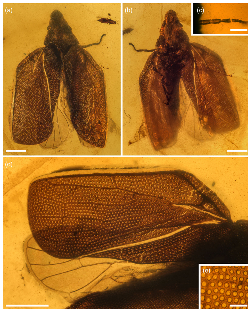
Fig. 3. (Colour online) Microphotograph of holotype (XFY10104) of Burmocercopsis lingpogensis gen. et sp. nov., from mid-Cretaceous Burmese amber. (a) Dorsal aspect; (b) ventral aspect; (c) showing details of antenna; (d) showing details of forewing and hind wing; (e) showing details of punctate. Scale bars = 1 mm in (a, b, d); 0.2 mm in (e); 0.1 mm in (c).

imp present; MP with two branches, connecting to CuA_1 by cross-vein mp-cua; CuA with two branches.