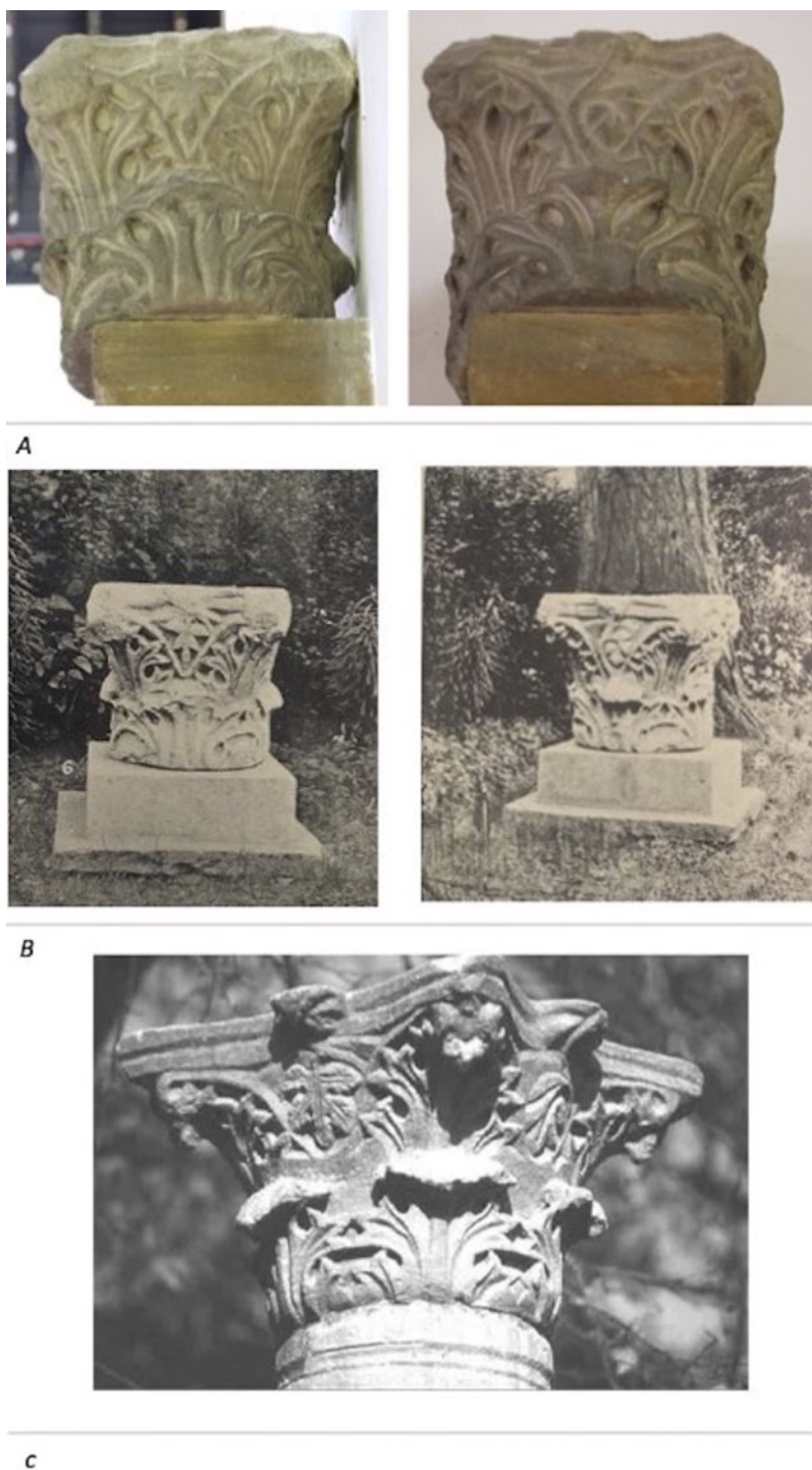
Fig 3. Lyre Capital from the Blachernai area and comparisons. A) Lyre Capital, Blachernai area, Constantinople, 5th-6th c., Lower Kingswood (Surrey), Church of the Holy Wisdom of God; B) Lyre Capital from the Blachernai area as it appears in Freshfield's Memorandum (1903); C) Lyre capital, 5th-6th c., Ayasofya courtyard (after Guiglia, Barsanti, Paribeni 2008).